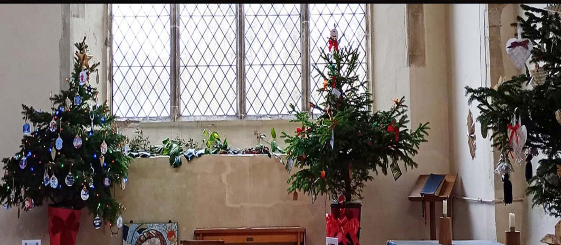
Christmas Tree Festival, St James' Church, Nayland How many trees are in the display in St James? 27