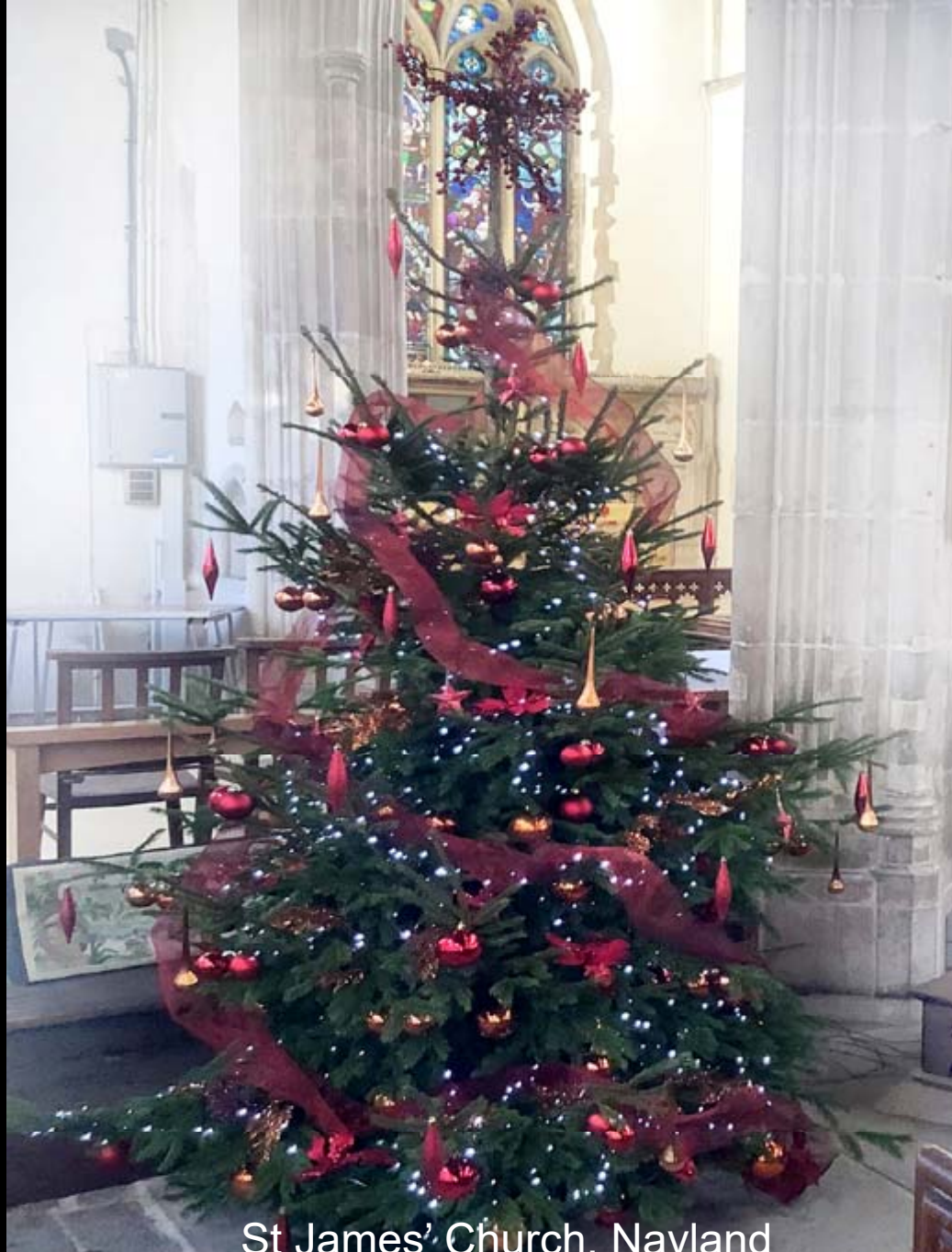
St James' Church, Nayland

Why do Christmas trees traditionally have a star on top ? To guide the Wise Men where to find the baby Jesus