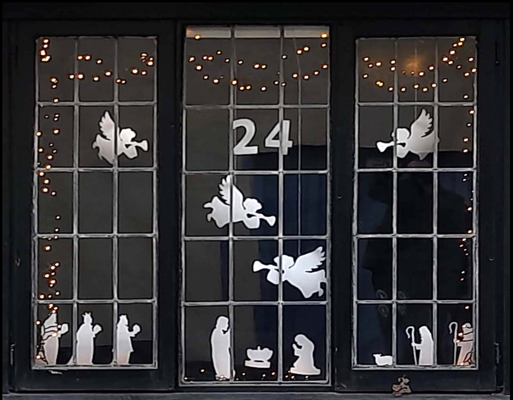
Butchers, 5 Bear Street