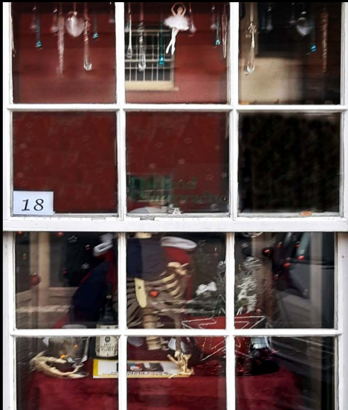
4 Church Mews, High Street