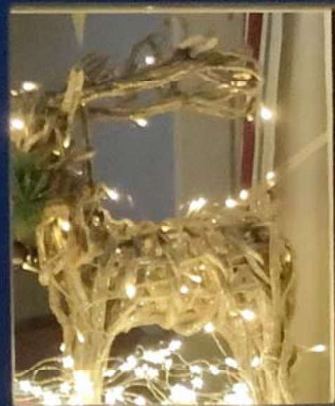
101 Bear Street