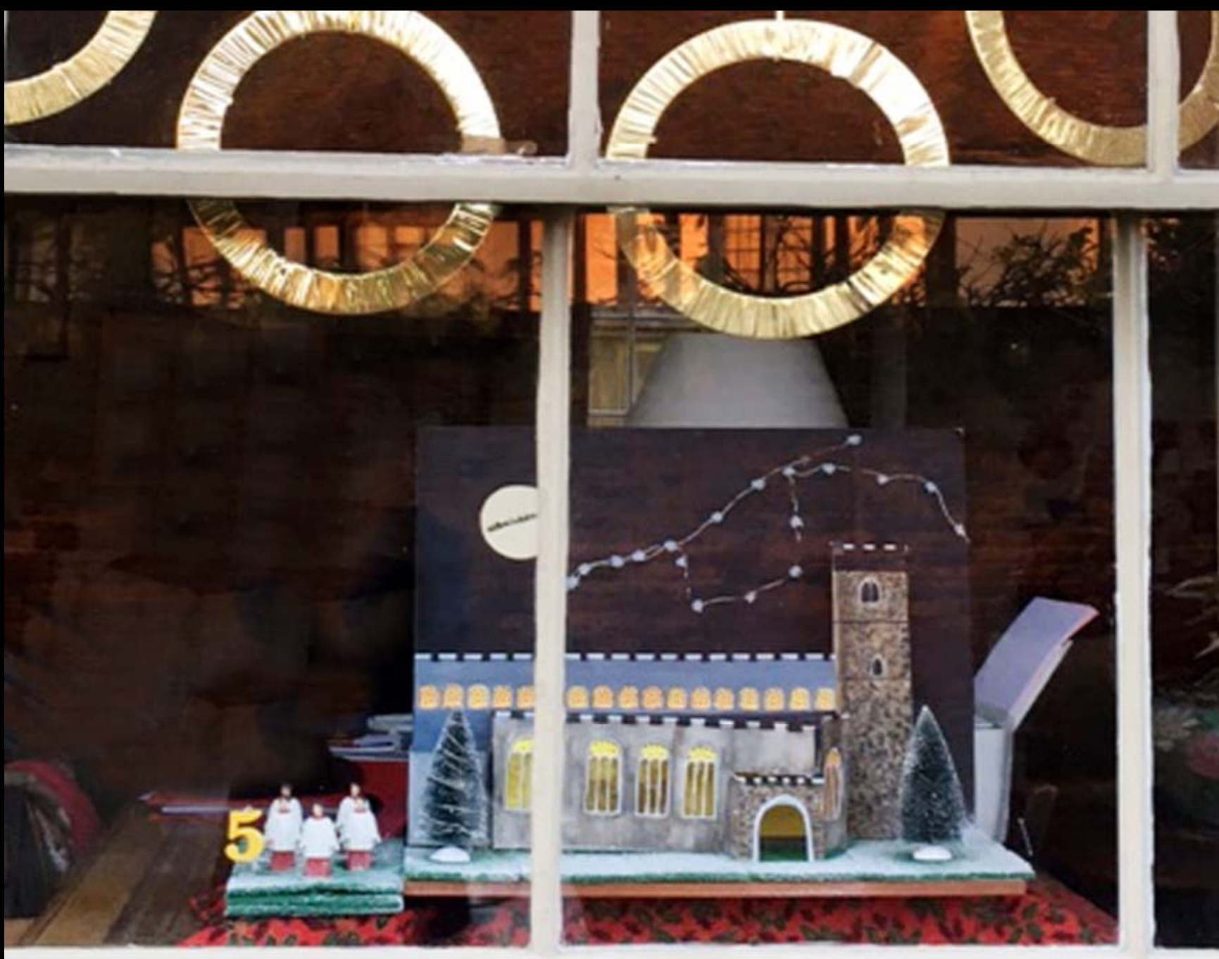
5 Court Street