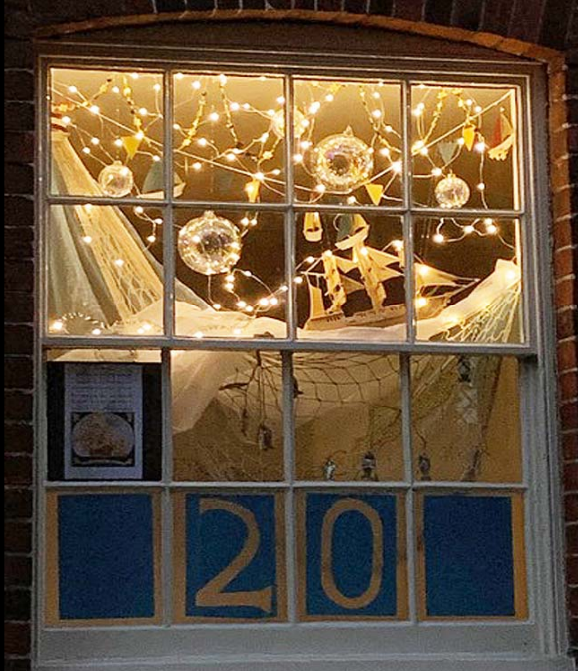
Old Brewery House, 20 Church Lane