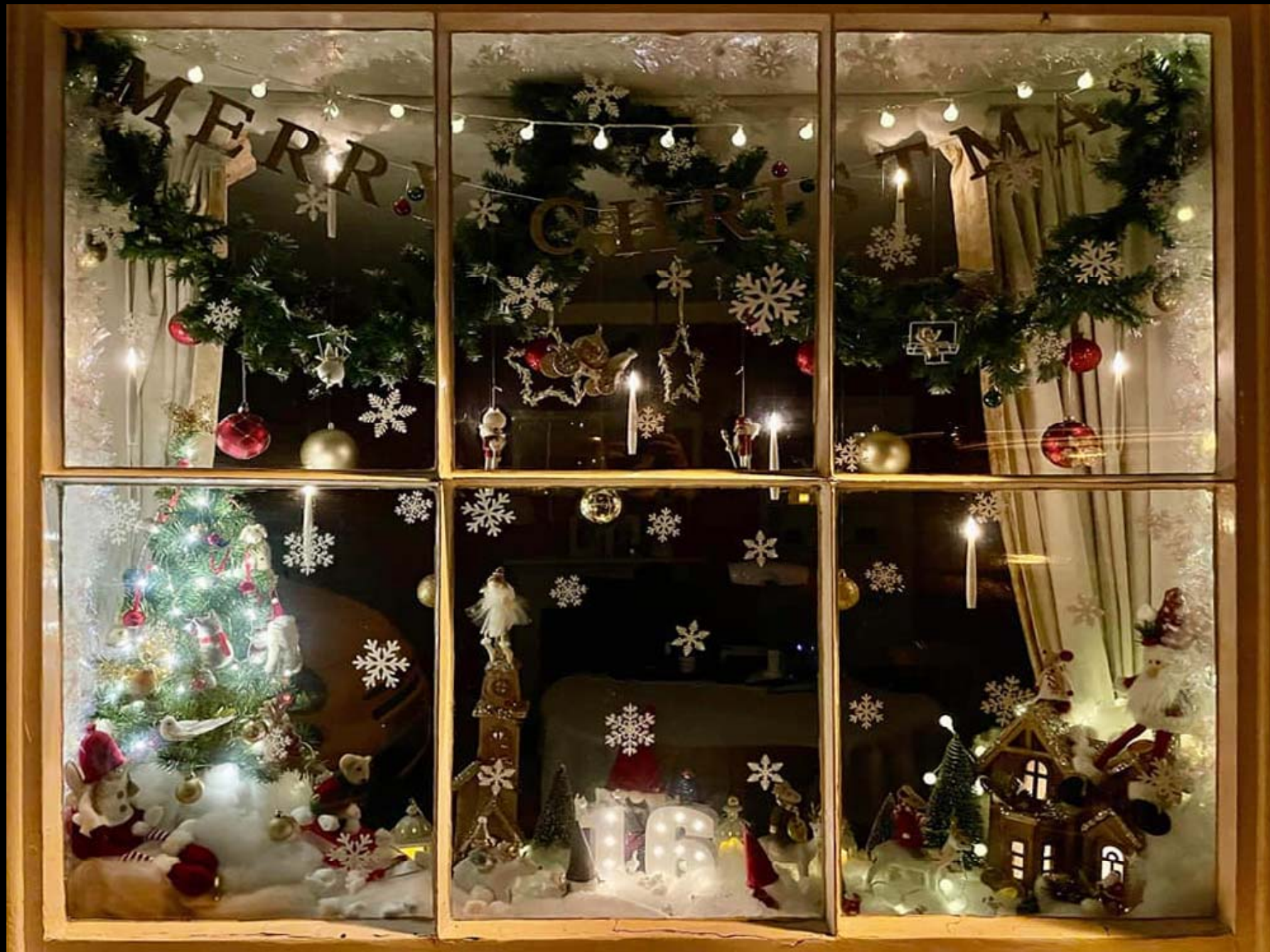
3 Court Street