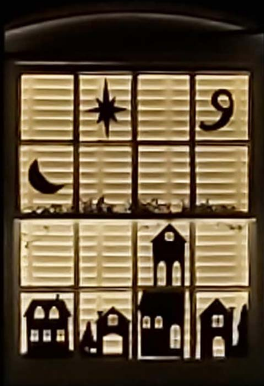
The Steam Mill House, Fen Street