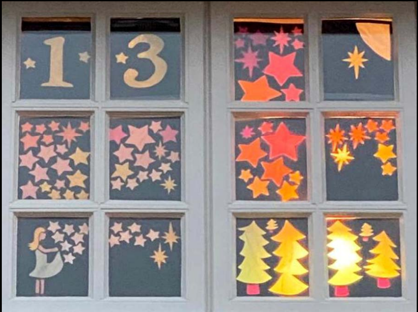
Perry Farmhouse, Bear Street