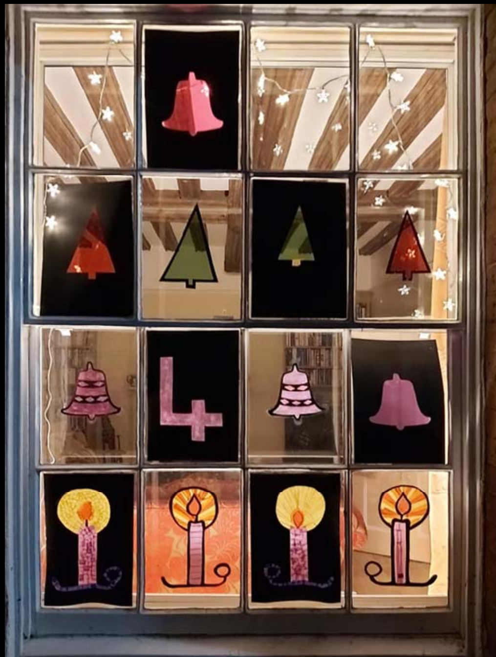
14 Bear Street