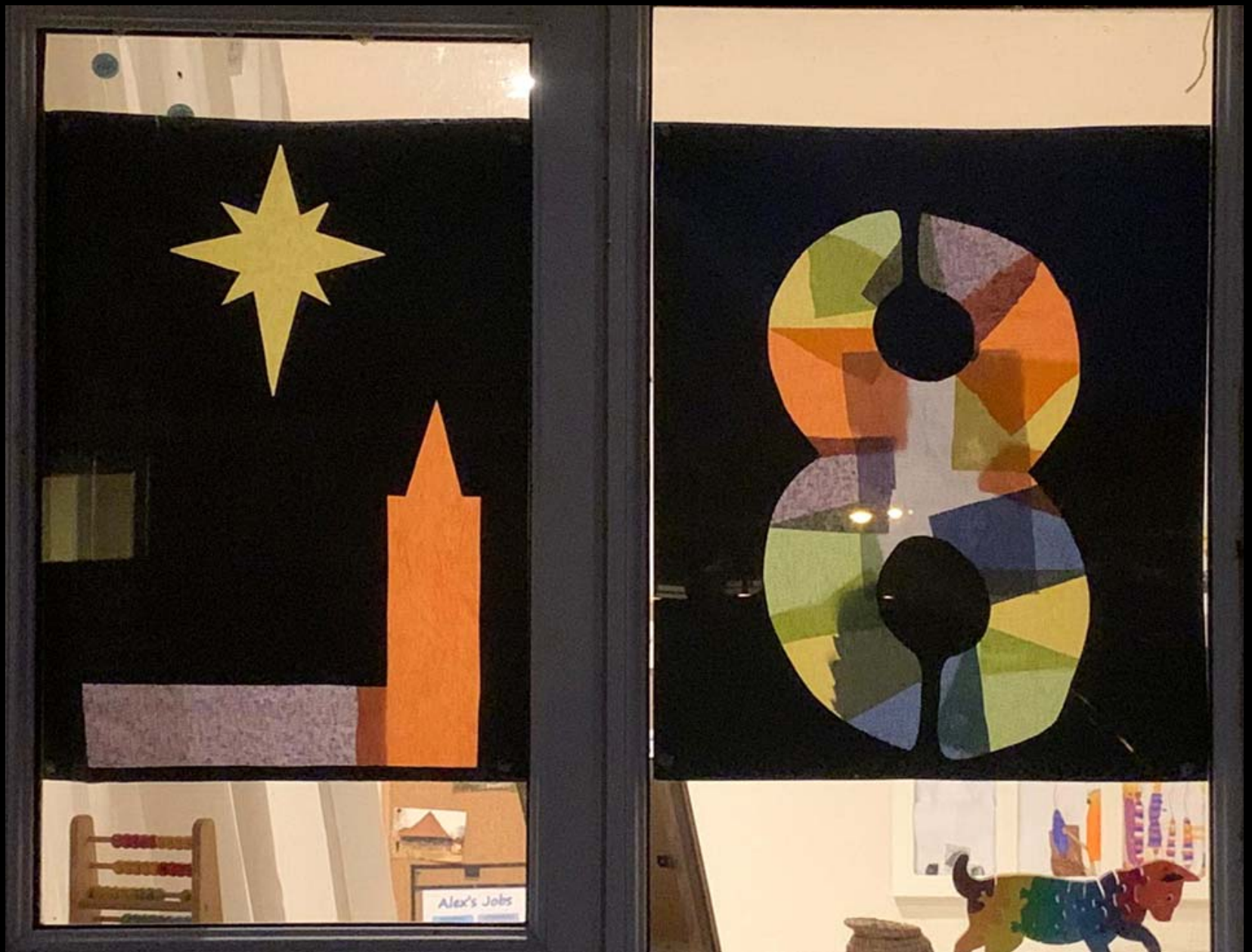
6 The Westerings