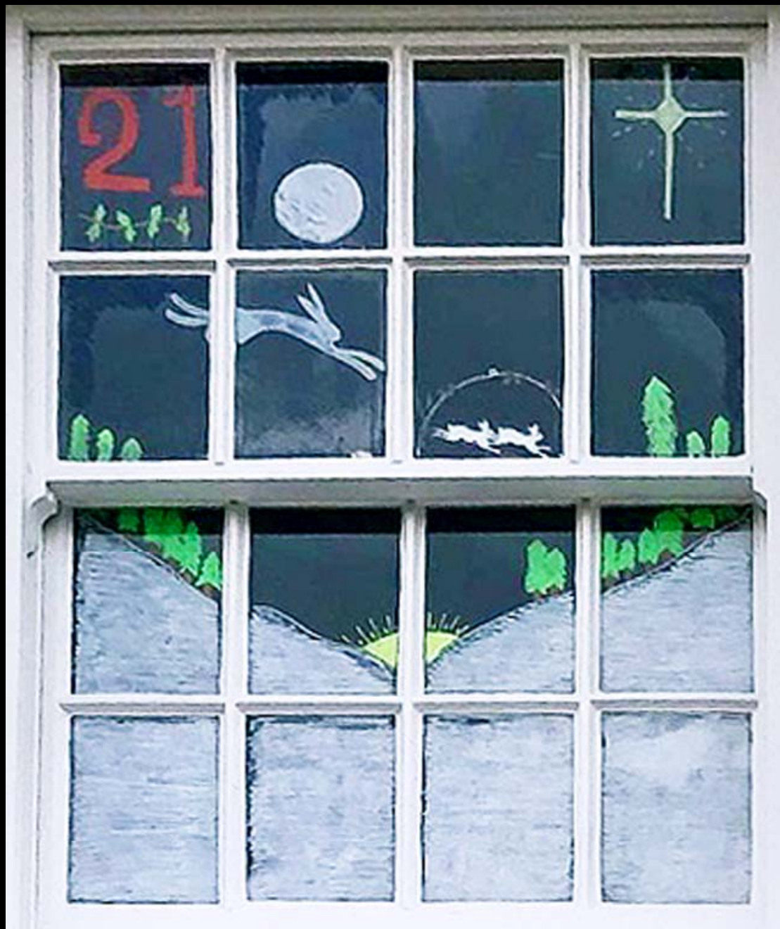
Laurel House, 25 Stoke Road