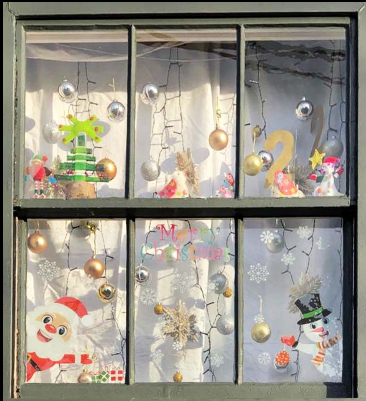
The White House, Church Lane