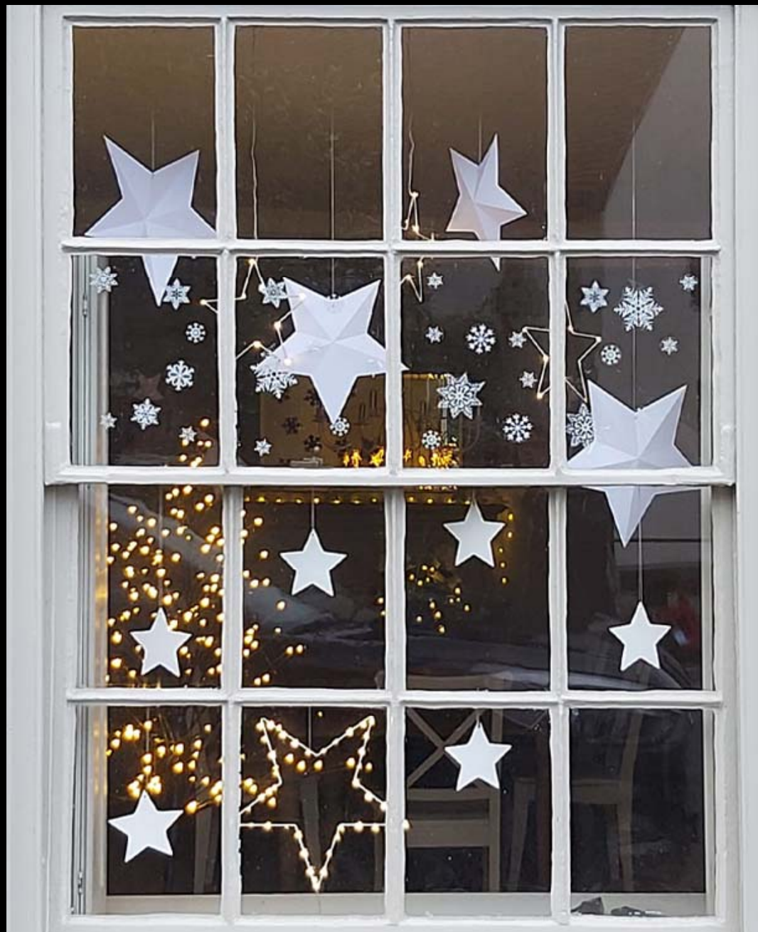
The Vine House, 1 Court Street