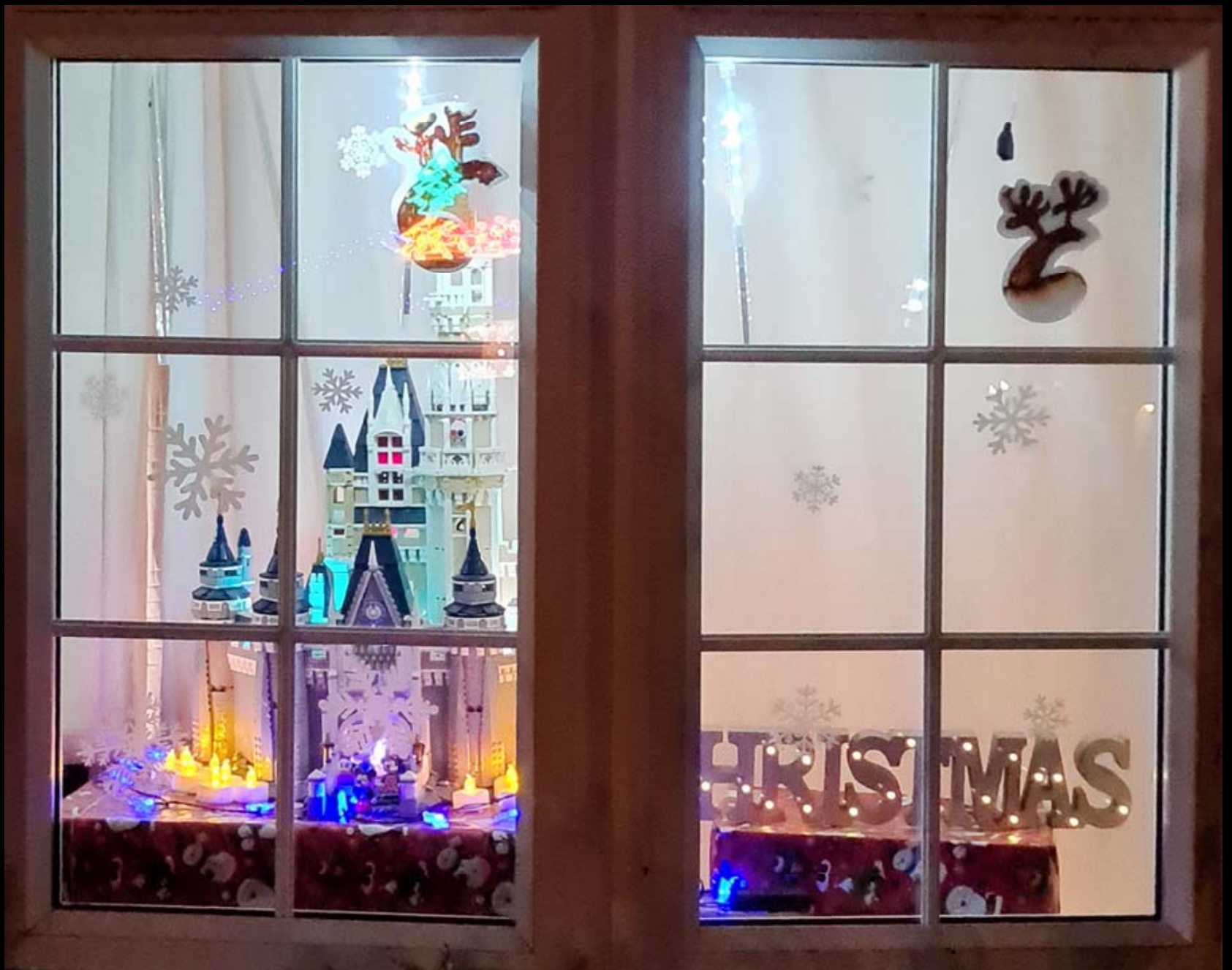
15 The Westerings