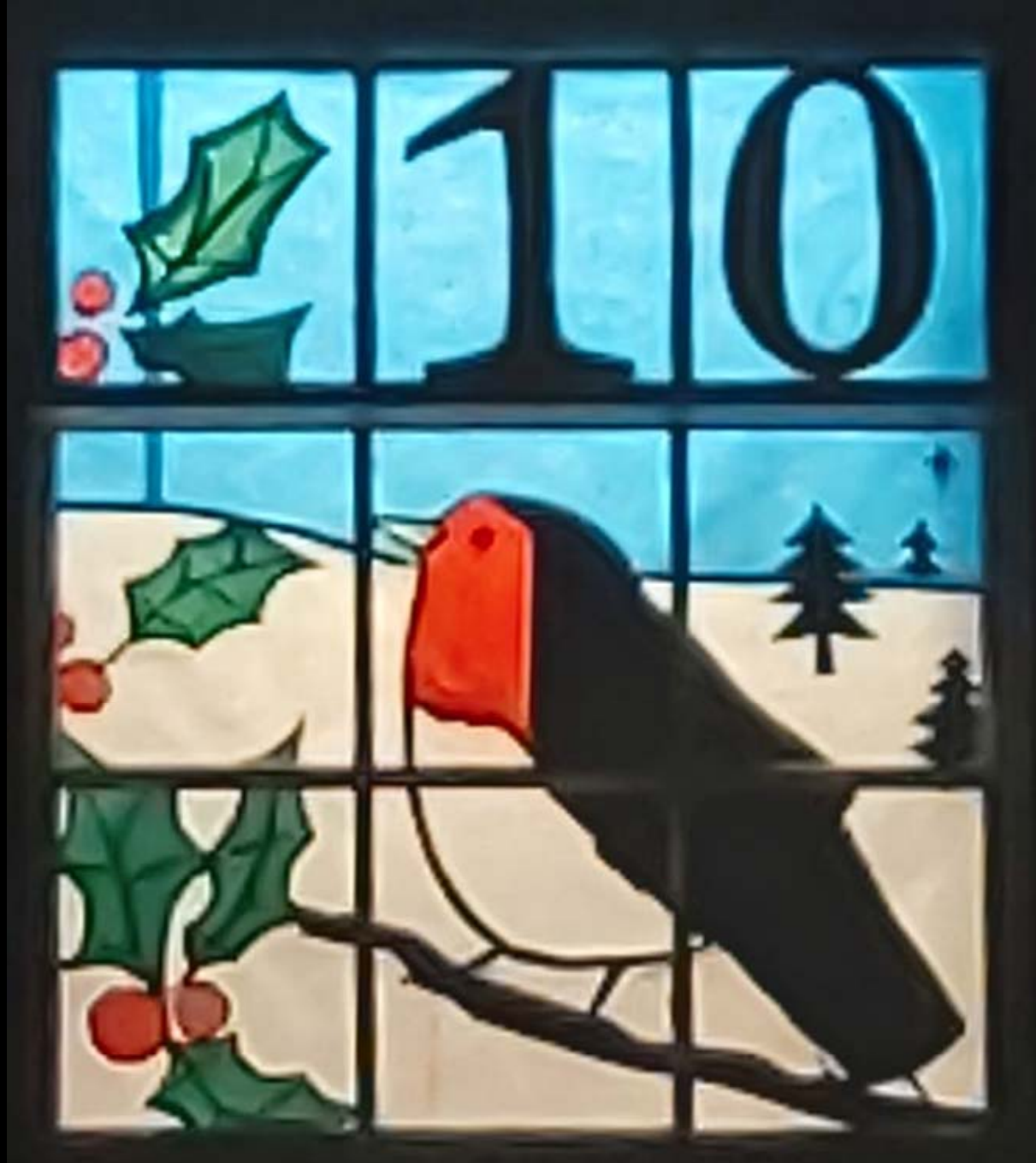
Hill House, 11 Gravel Hill