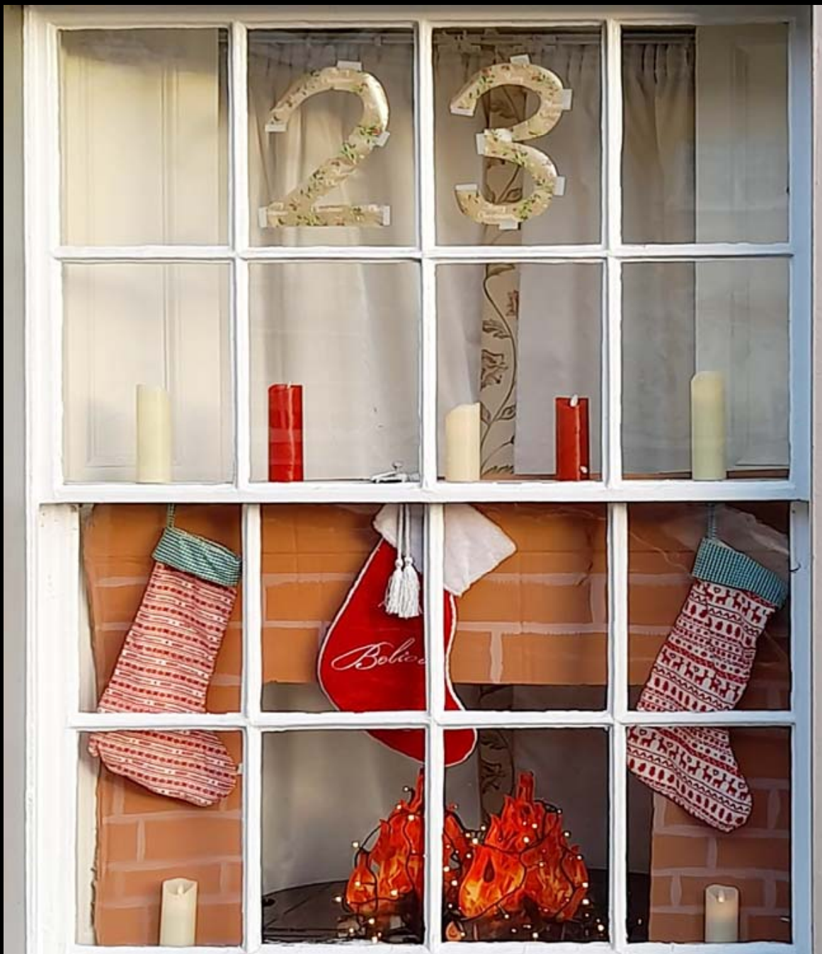
The Old Vicarage, 4 High Street