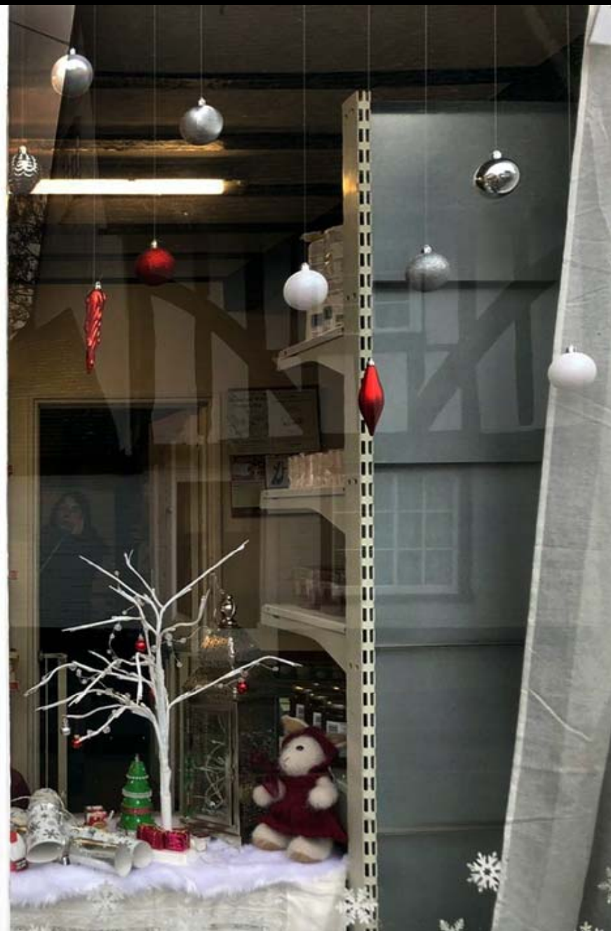
2 Birch Street