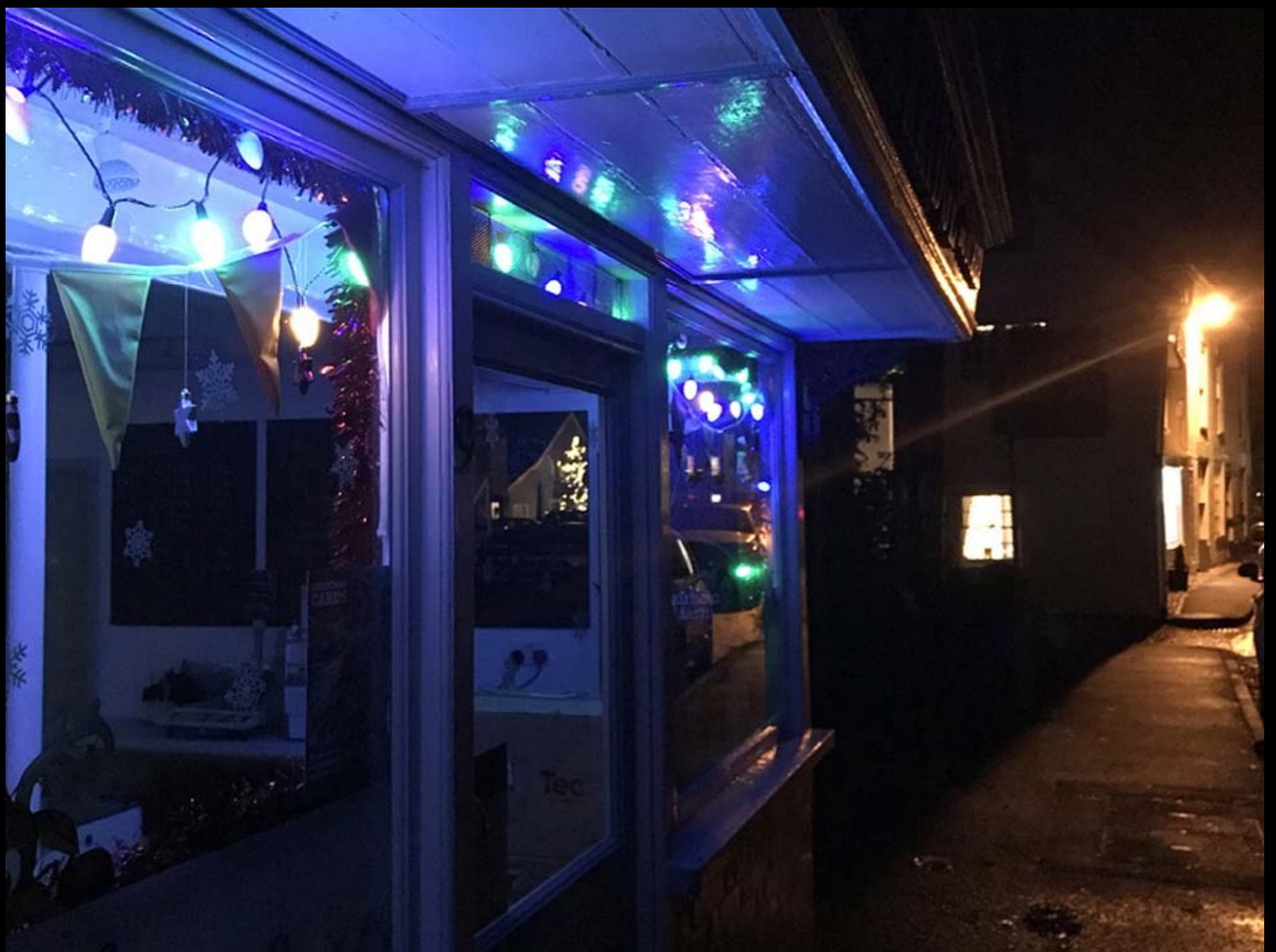
9 Court Street