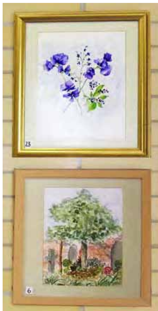
The work of the highly talented Nayland Art Group was on display throughout the weekend in the Village Hall.