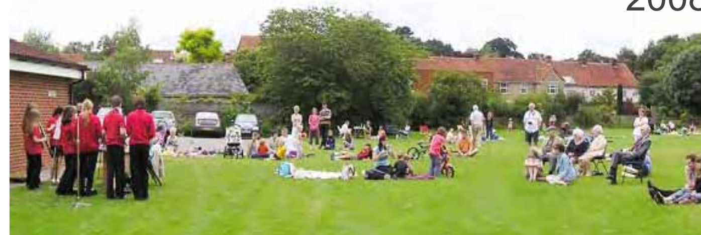
Villagers gathered for a Sunday afternoon family picnic, listening to the melodies of the Stoke by Nayland Middle School Jazz Band

through an exhibition of old Nayland documents and artefacts. Almost eighty people took the opportunity to have their own treasures valued by experts from Reeman Dansie. My own Hornby train, though very valuable to me, will not unfortunately finance my retirement!