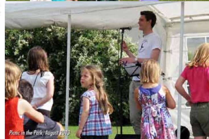
Picnic in the Park, August 2013