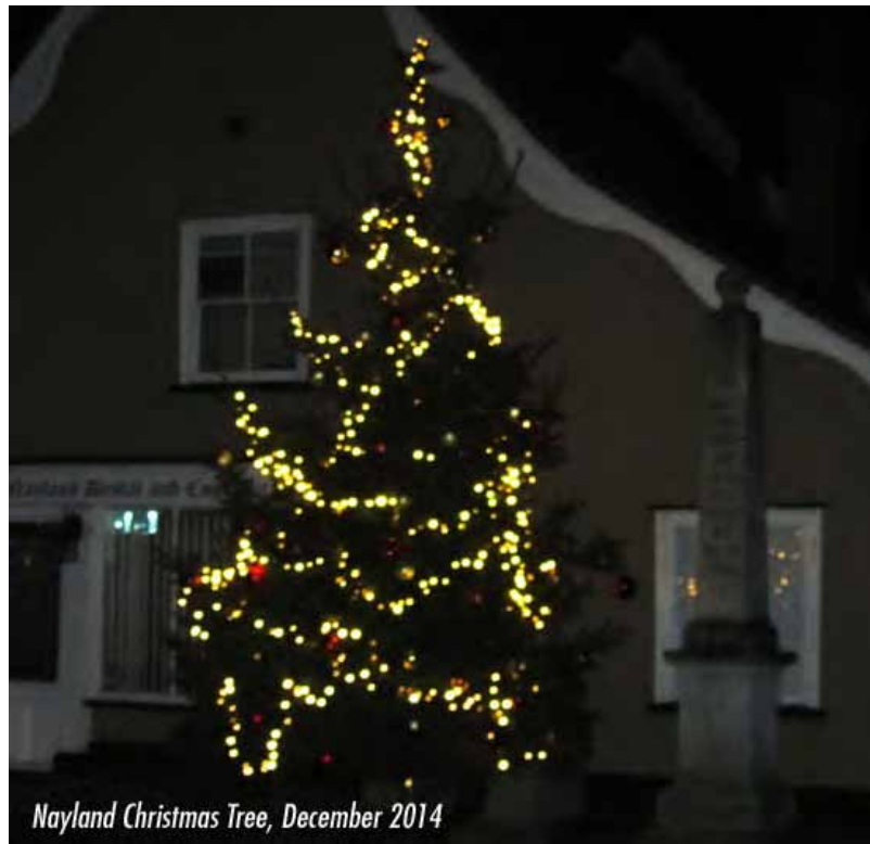
Nayland Christmas Tree, December 2014