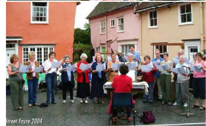
Top left: Nayland School's Country dancing Second top; The Village Player's Bawdy Saloon Bar scene Centre: Village Society Stalls; the Horticultural Society Right: Nayland Village Choir