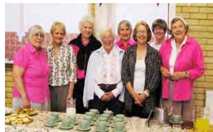
The ladies of the WI were once again queens of hospitality, providing their refreshing drinks, delicious cakes, and cooling ices.

Sunday evening was a musical feast. There were queues outside the Village Hall at 6.45pm, such was the enthusiasm for Nayland