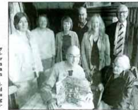
Treasured heirloom ... the antiques valuations got under way at Nayland. Picture 6hw1207020 by Helen Whitcombe available at www.photostoday.co.uk

The conservation society held an exhibition of Nayland by-gones in Carvers' Barn where two experts from auctioneers Reeman Dansie valued numerous objects in a