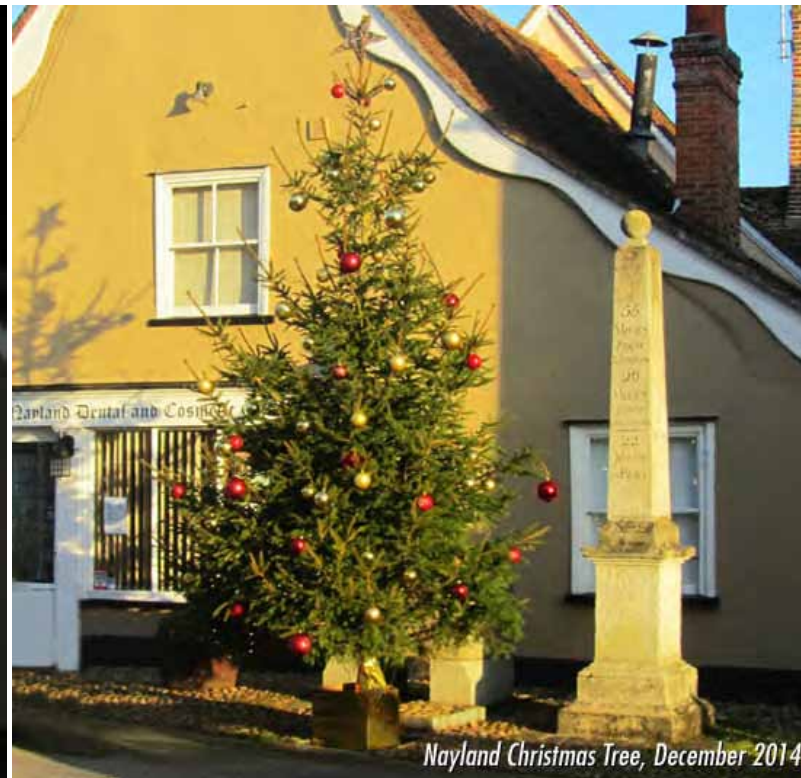
Nayland Christmas Tree, December 2014