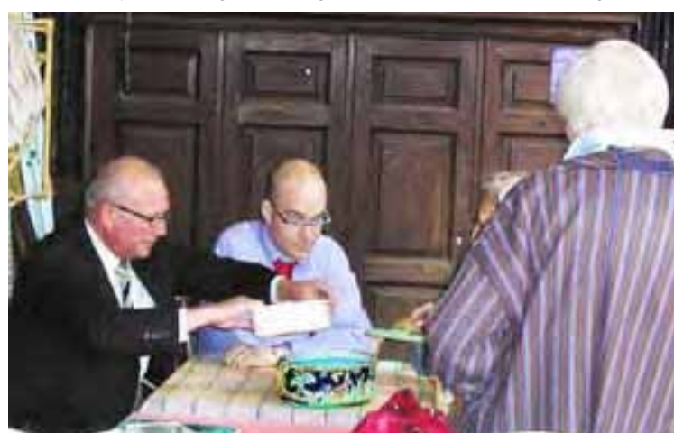
At the 'What It's Worth' session organised by the Conservation Society two experts from Reeman Dansie identified and valued over 70 items.

The film, Akenfield had arrived two weeks before; the cinema equipment reserved two months earlier and the new electric screen went into place that morning. The ice-creams were in the freezer; the bar was open and the Village Hall car park was flooded! The Art Group had set up their fine contribution in the Village Hall bar and St James' Church was decorated by the Hortsoc's stunning flower exhibition.