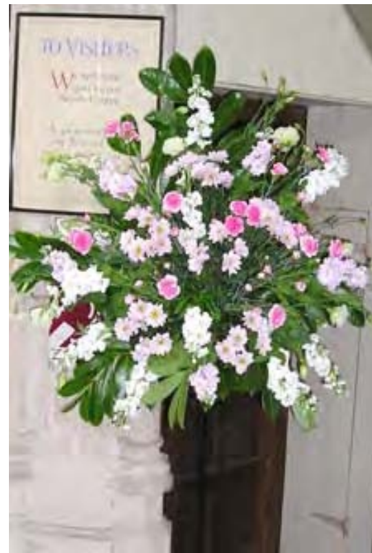
A spectacular exhibition of flower arrangements by the Horticultural Society was on display in St James' Church throughout the weekend.