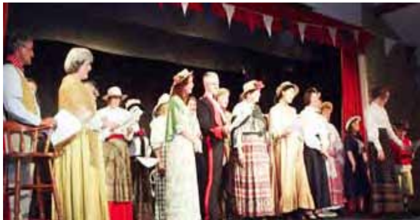
The Sunday evening performances, Songs from the Shows by Nayland Choir (below) and the Village Players' Olde Tyme Music Hall (above) ended the festival in style with appreciative cheers from the audience.