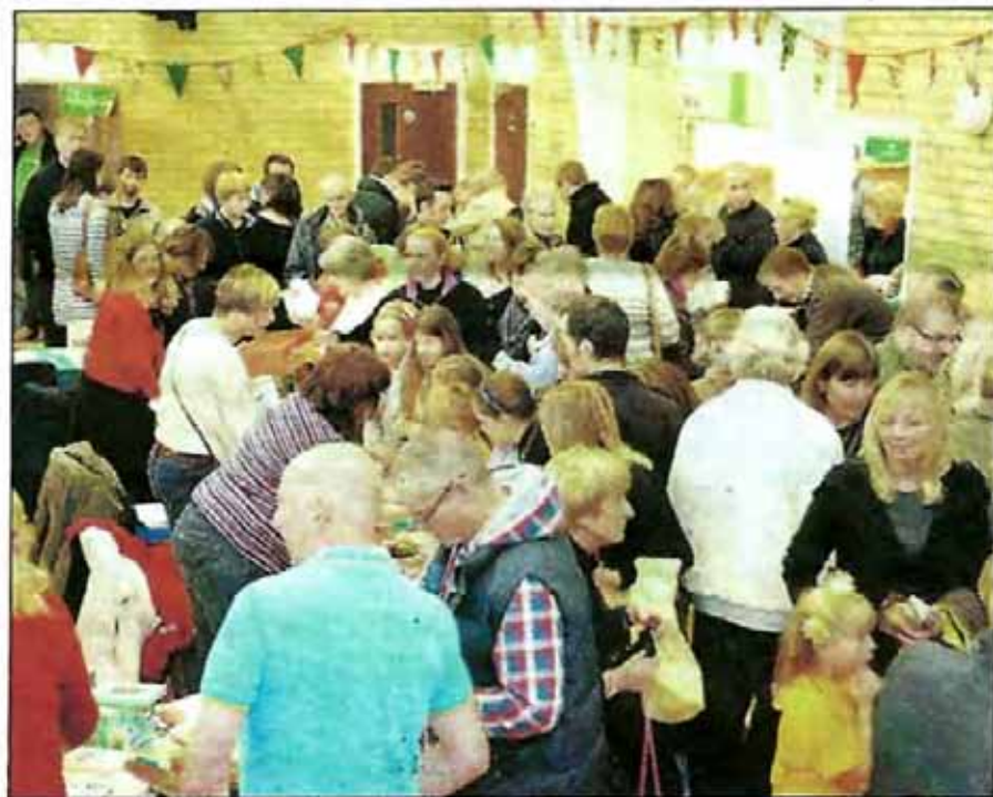
JINGLE ALL THE WAY: Shoppers packed into Nayland Village Hall at the weekend for the annual Christmas fair.

Father Christmas was also there with his Elf and was kept busy as youngsters queued up to meet him.