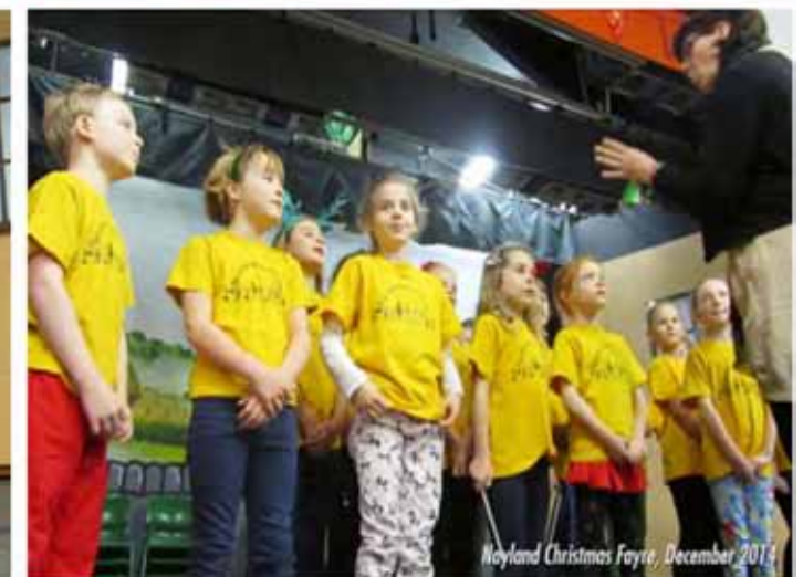
Nayland Christmas Fayre, December 2014