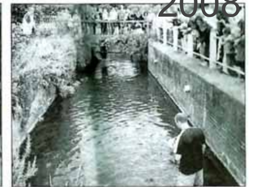
They're off ... the duck races in Nayland's mill stream at Fen Street

The community council ran a successful barn dance and on Sunday families enjoyed a