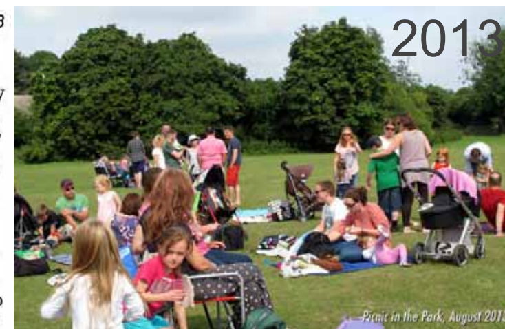
Picnic in the Park, August 2013

Villagers are invited to bring their own picnics and drinks and enjoy lunch together. An open mic and piano will be provided and keen musicians are invited to take part. Local band Electra will entertain for the last half-hour. The picnic will be preceded by a duck race in Fen Street at 1pm.