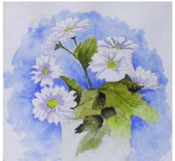
Study in Blue – Liz Thorne