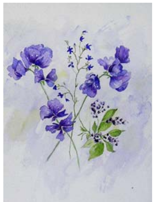
Sweet Peas – Liz Thorne