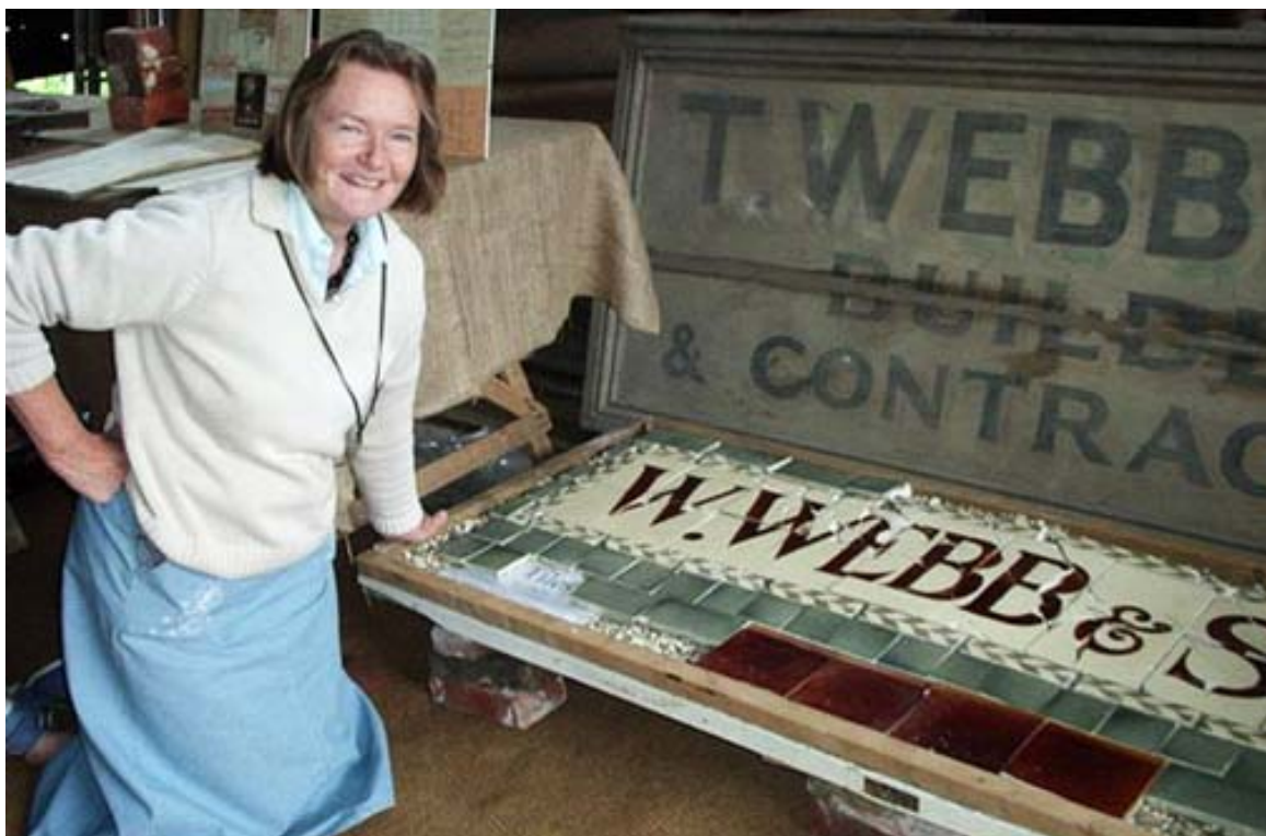
The exhibition included reassembled tiling which had once adorned the shop-front of Webb's butchers, 8 High St. The shop ceased trading in 1974 and the tiles were removed in the 1980s and kept in storage. The pieces were put back together for the exhibition by Andora Carver, Hon. Secretary of the Conservation Society."