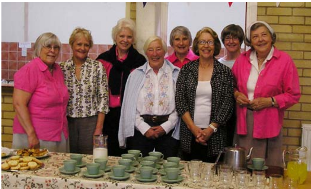
The ladies of the WI were once again queens of hospitality, providing their refreshing drinks, delicious cakes, and cooling ices.