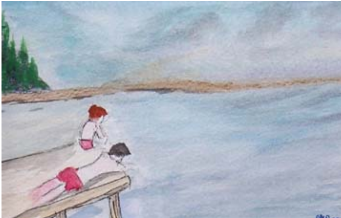
A Summer Day – Sheila Sessions