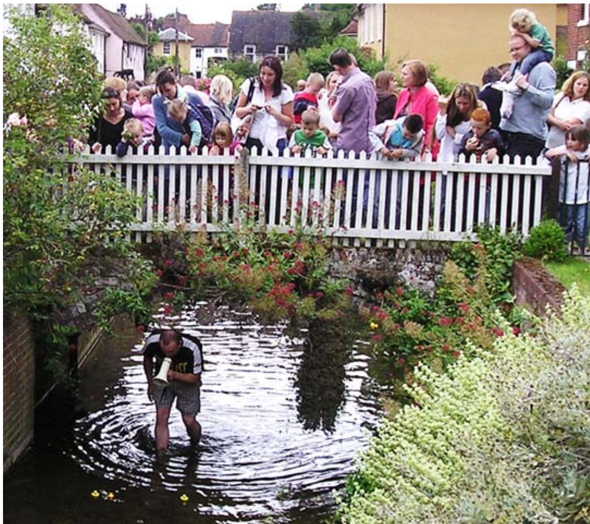
The final furlong ..... It's a three duck nail-biter towards the finish as the crowd cheer them on from above.