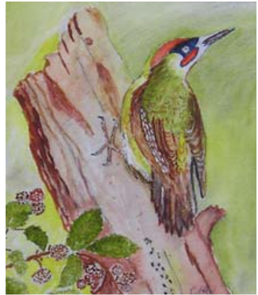
Woody the Woodpecker – 'Ginger' Westlake