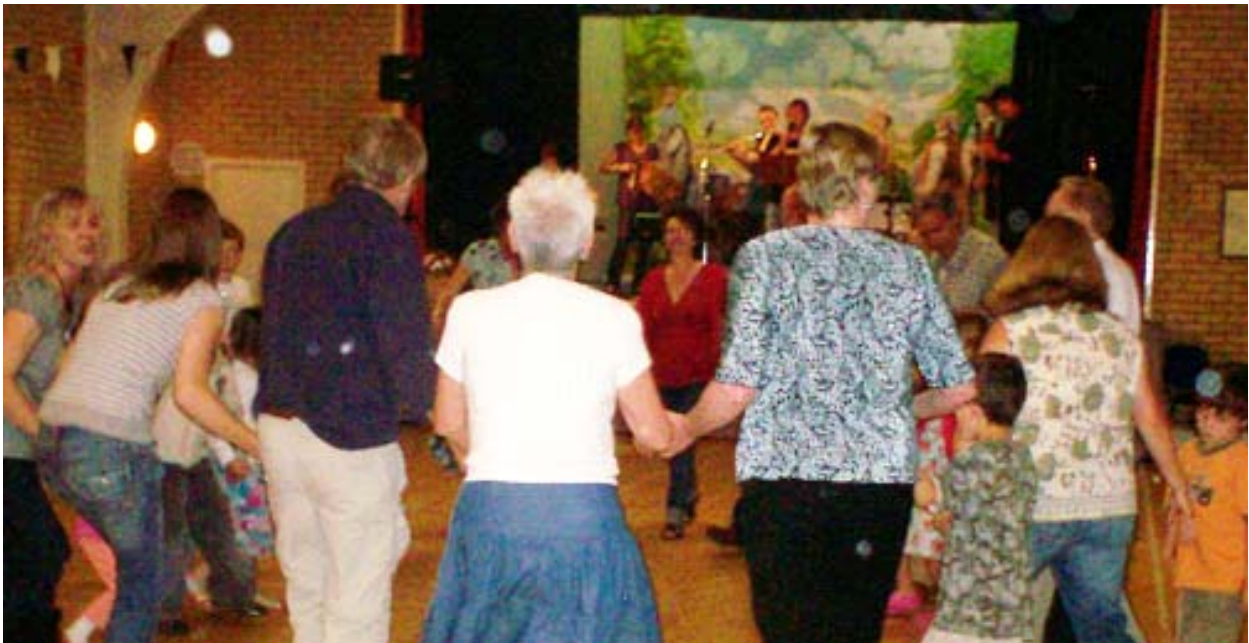
The Barn Dance went with a swing as music by 'Kegs' enticed adults and youngsters onto the dance floor.