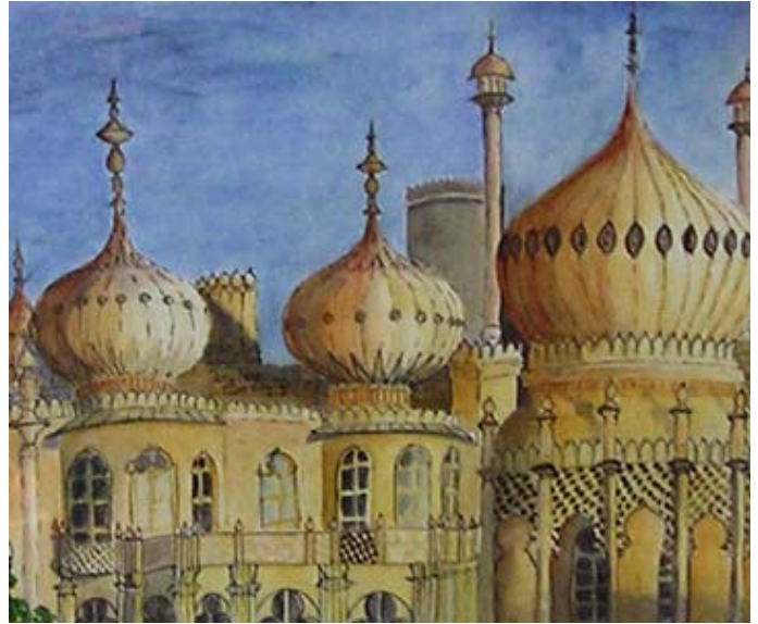
Brighton Pavilion – Betsy Cordingly