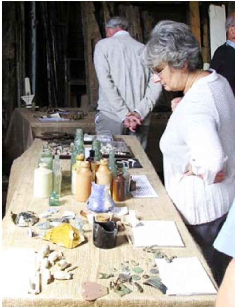
The crowds then turned their attention to the Conservation Society's Bygones Exhibition held in Carvers' Barn. The display included a collection of village artefacts belonging to Wendy Sparrow and a selection of historic tins from Beaumont's shop which belonged to Muriel Norfolk.