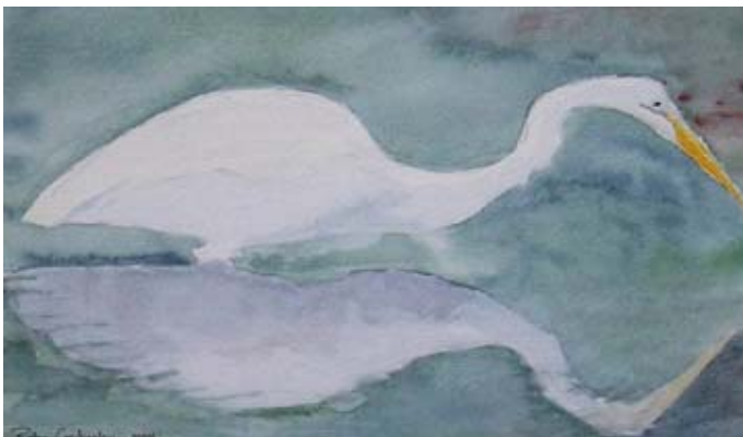
Egret Fishing – Betsy Cordingly