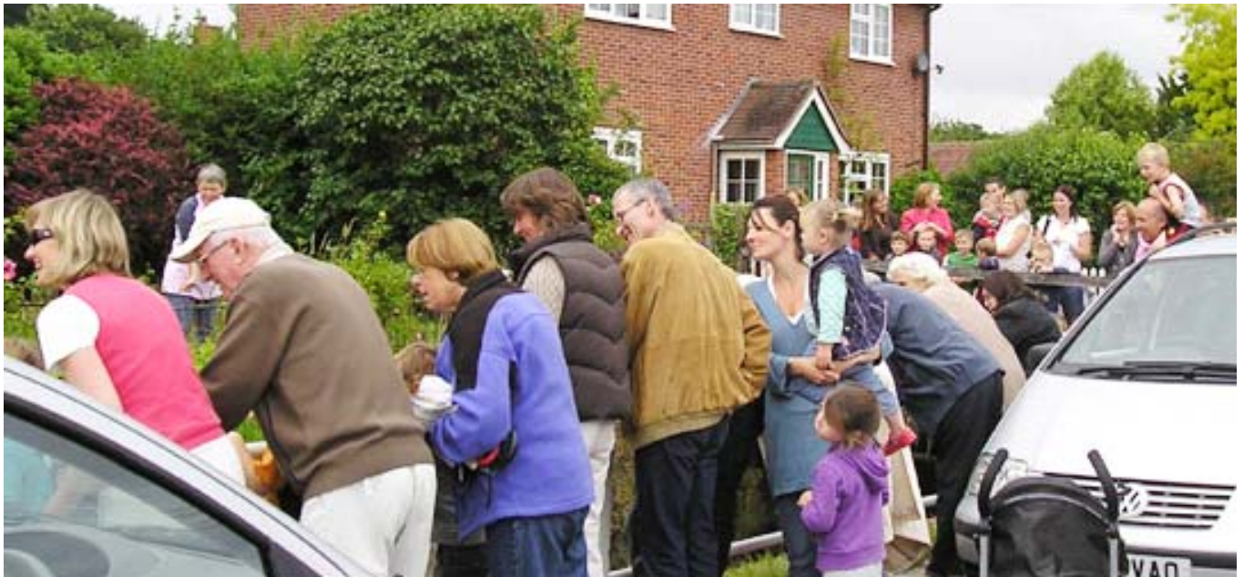
Crowds of excited spectators lined Mill Stream following the progress of their ducks. Many thanks are due to Fen Street residents for allowing the crowd to utilise every inch of available space.