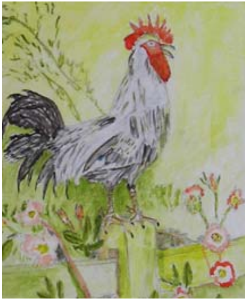
'Corky' - – 'Ginger' Westlake