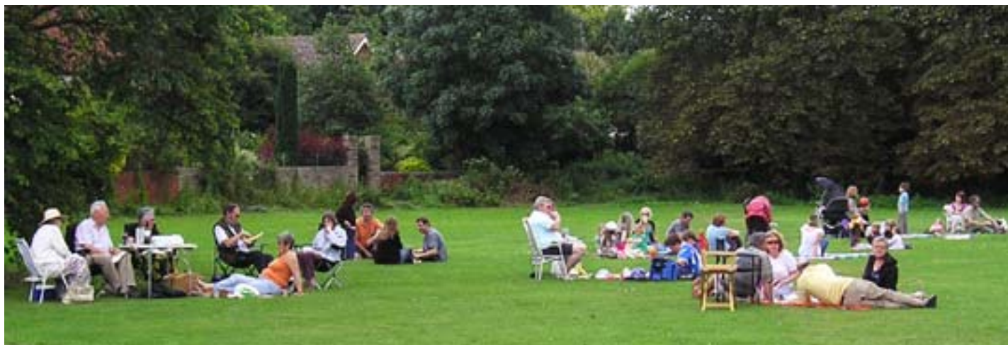
While some preferred the slower pace