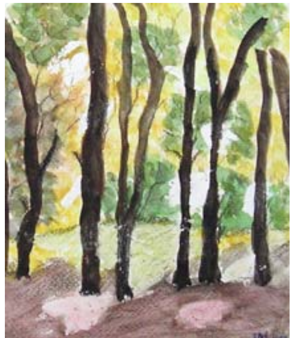
Trees – Sheila Sessions