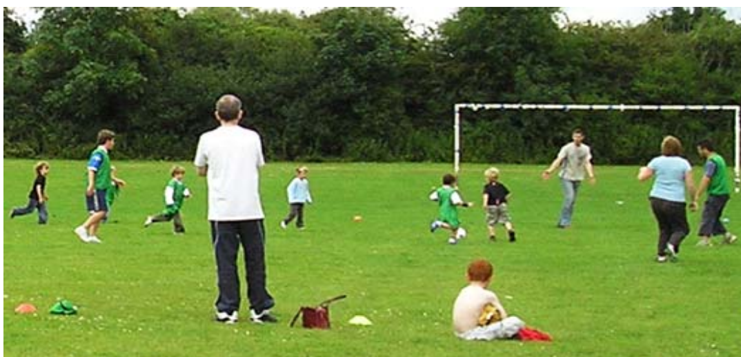
The youngsters played a variety of games laid on by the Youth Club