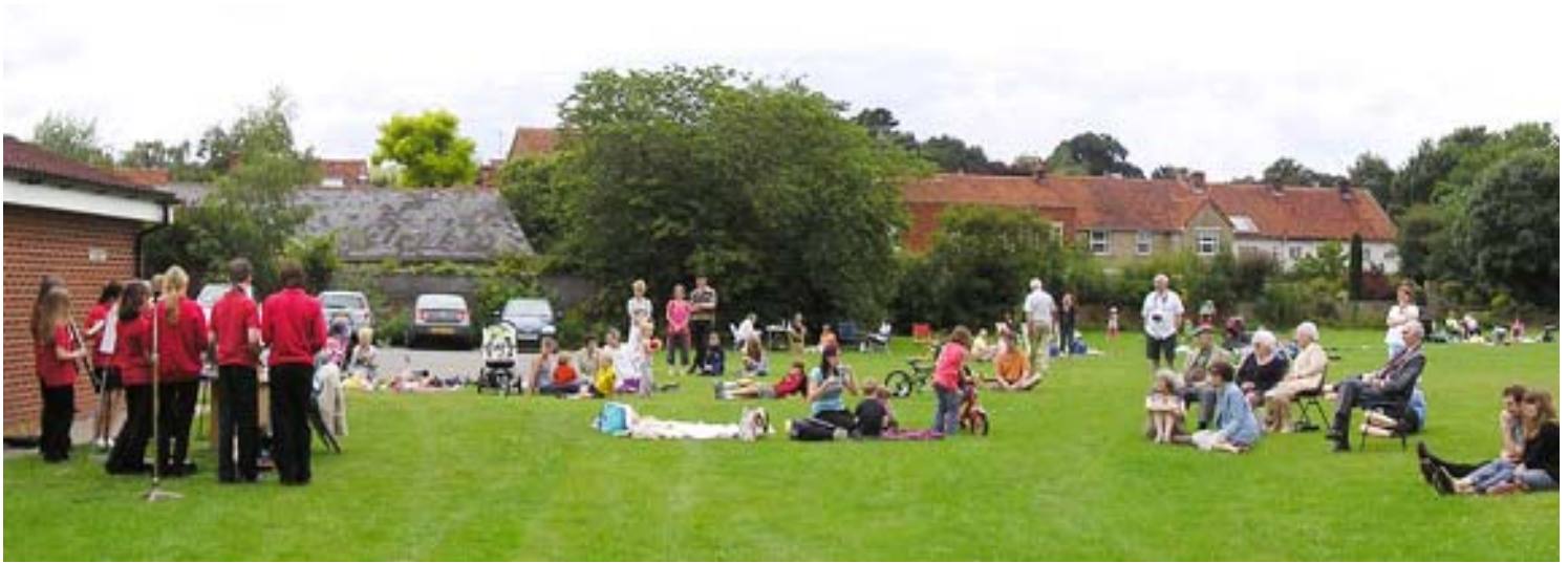
Villagers gathered for a Sunday afternoon family picnic, listening to the melodies of the Stoke by Nayland Middle School Jazz Band