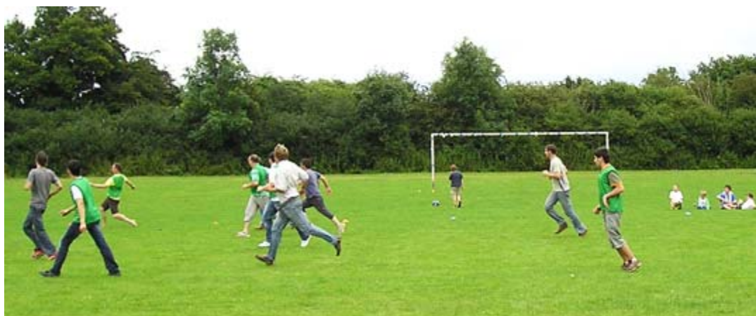
Then there were the competitive fathers who would not be outdone!