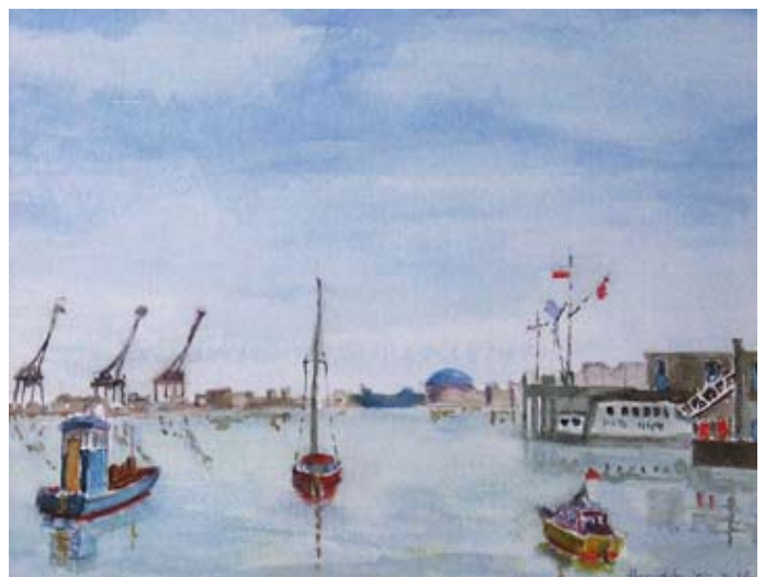
Harwich Harbour