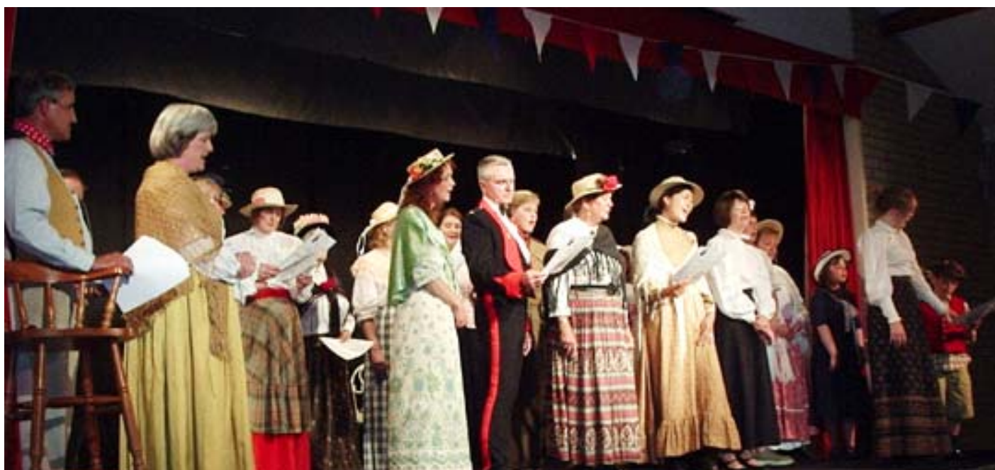
The evening performances, Olde Tyme Music Hall by the Village Players' and Songs from the Shows by Nayland Choir, ended the festival in style with appreciative cheers from the audience.