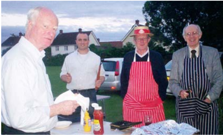
Members of the Royal British Legion were kept busy providing hot dogs and burgers during the Barn Dance