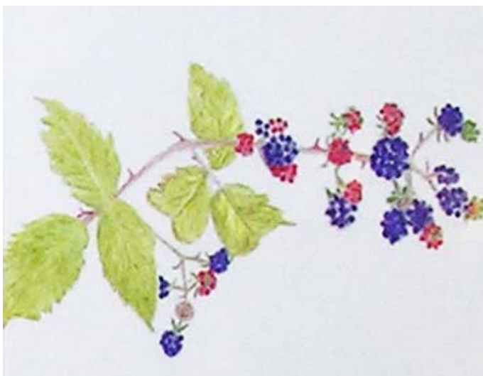
Blackberries – Val Seymour