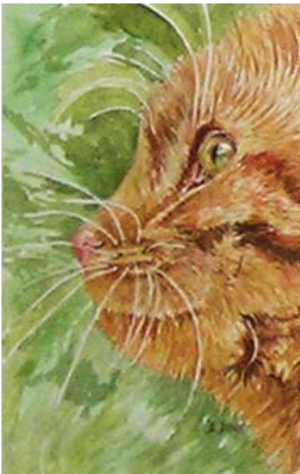
'Ginger' - Diane Dent