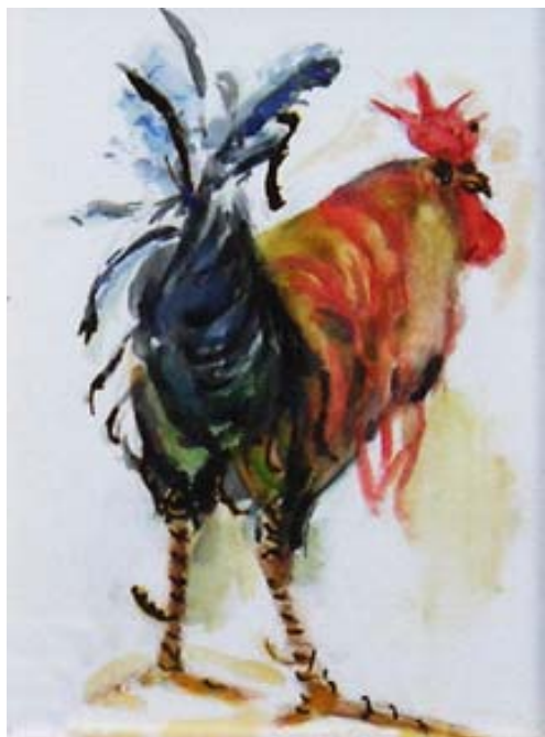
Cockerel – Peggy Shreeve