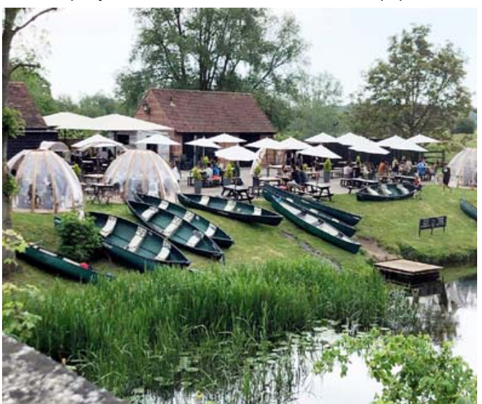
A group of ten Canadian style canoes parked up for an organised 'paddle 'n' pub' Sunday lunch

That said, the River Stour Trust and Dedham Vale & Stour Valley AONB are promoting the enjoyment rivercraft can bring and several companies and riverside restaurants have taken advantage of the trend and tempting options are being offered. There are numerous deals from companies in Sudbury on 'Paddling Adventures' and 'Paddle 'n' Pub' and the Anchor Inn at Nayland is one of the pubs included; there are even one way options where the craft is collected from the pub by the hire company. Rivercraft hire from Wiston is also popular.