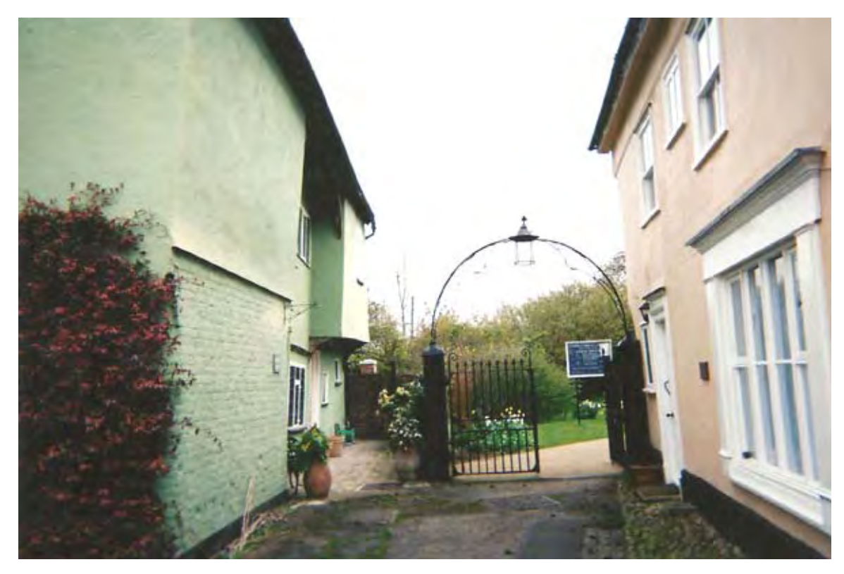
St James Churchyard Gate in High Street