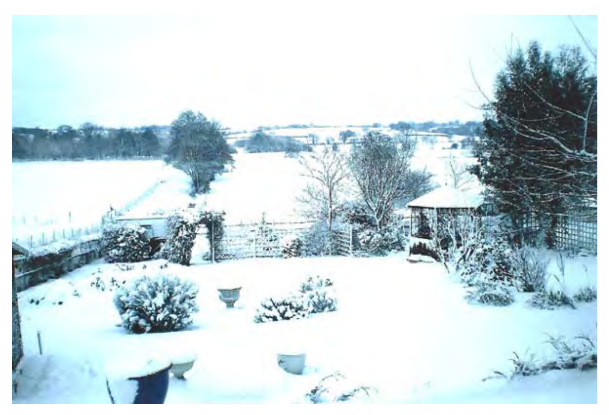
Sandra Gibbons: Valley view in winter at Wiston