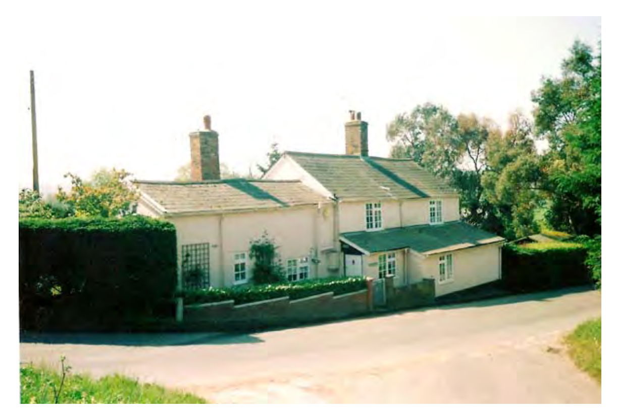
Frances Bates: The Old Fox, Wiston