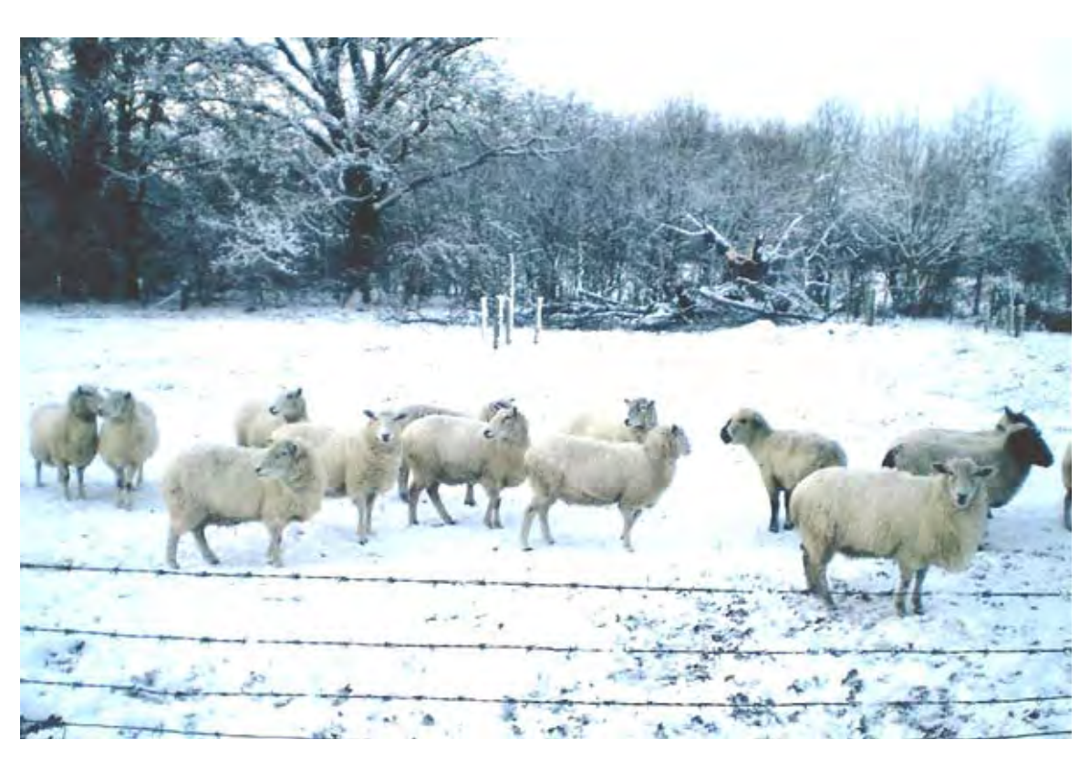
Sandra Gibbons: Sheep grazing near Wiston Church