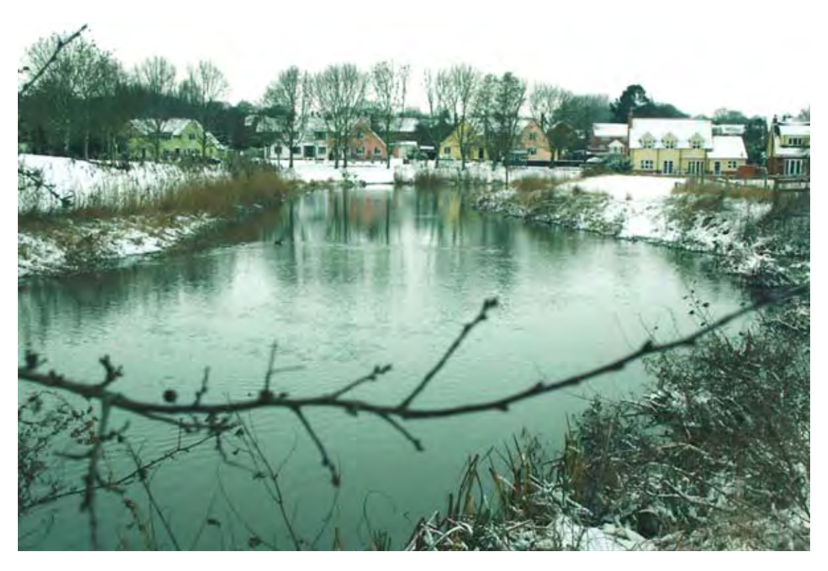
Trevor Smy: River Stour in winter