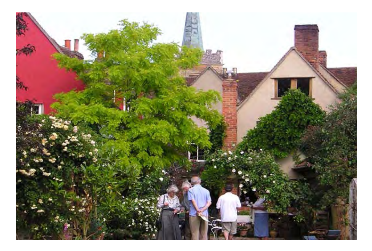
Antony Day: Open Gardens at the Post Office