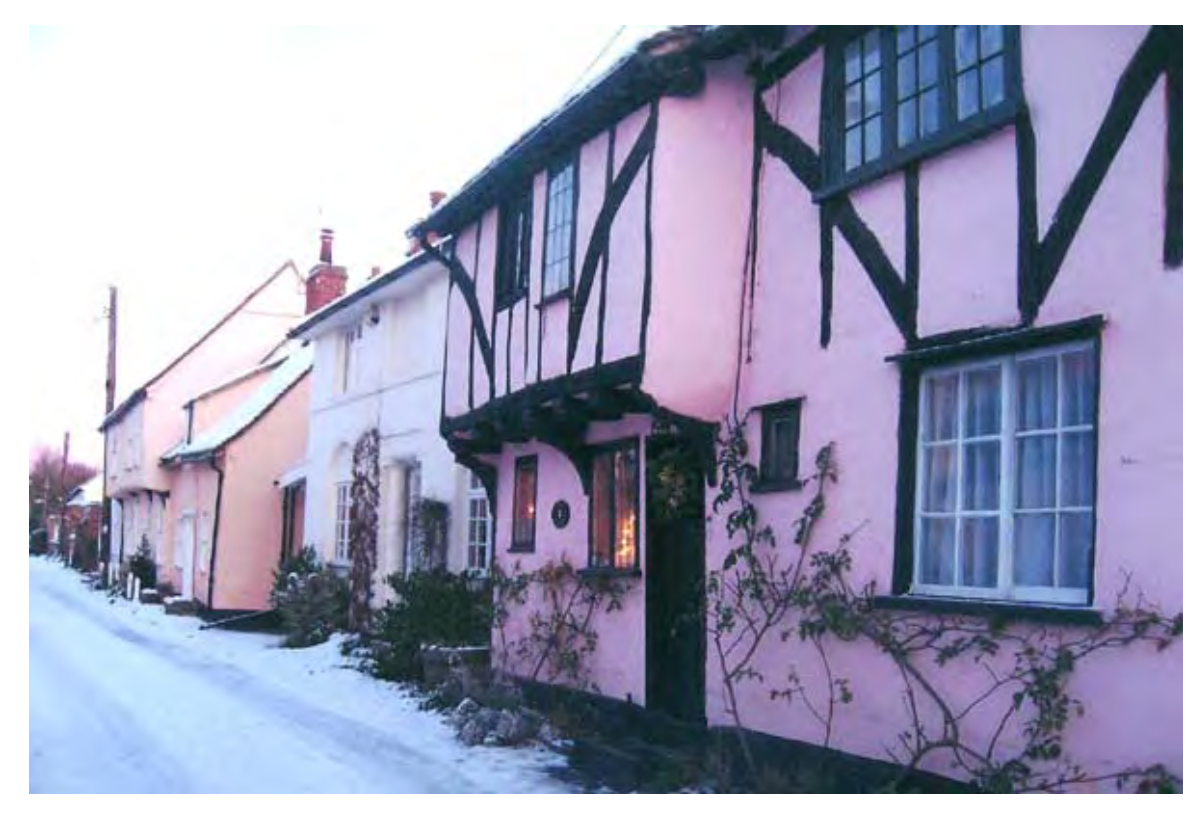
Mary Knapp: Fen Street in winter