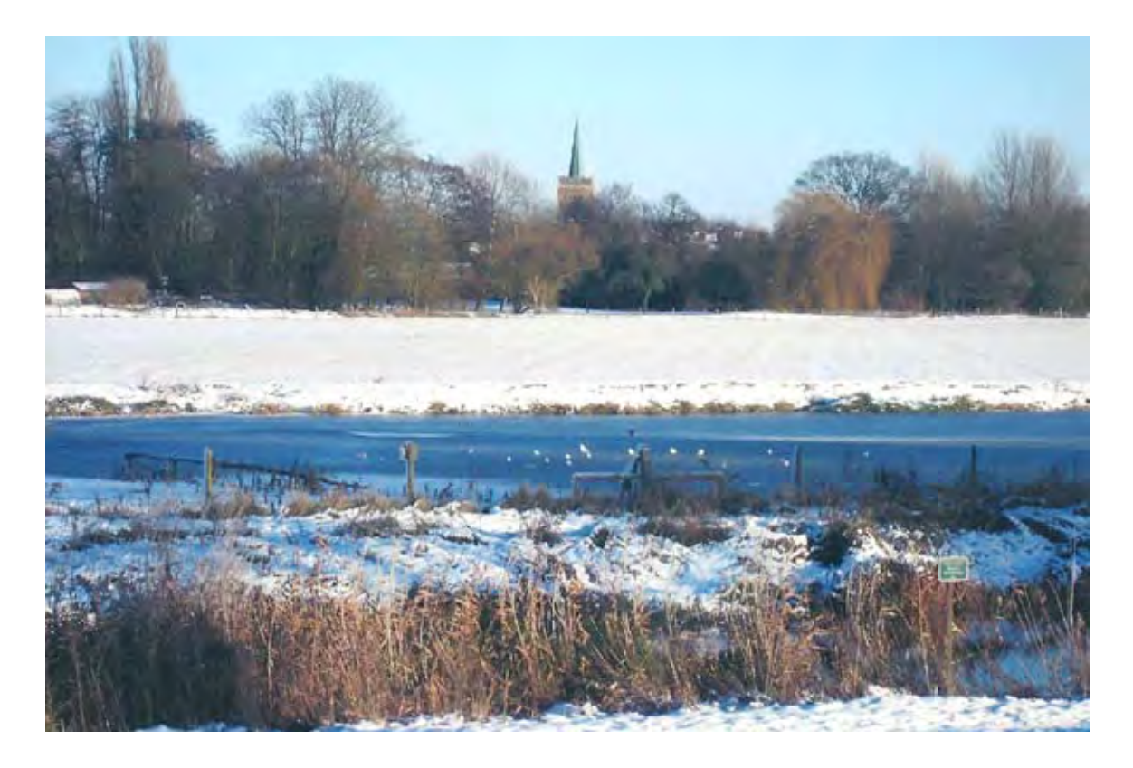
Mary Knapp: View across Nayland Meadow in winter