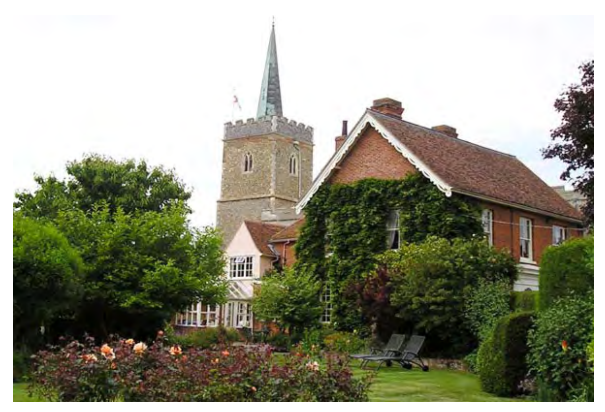
St James tower from The Butts