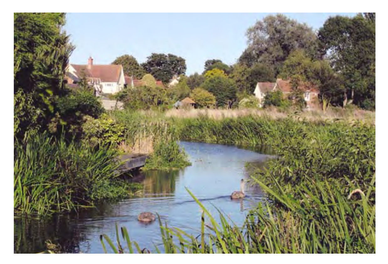
Graham Wiles: Cygnets near Lock Cottage