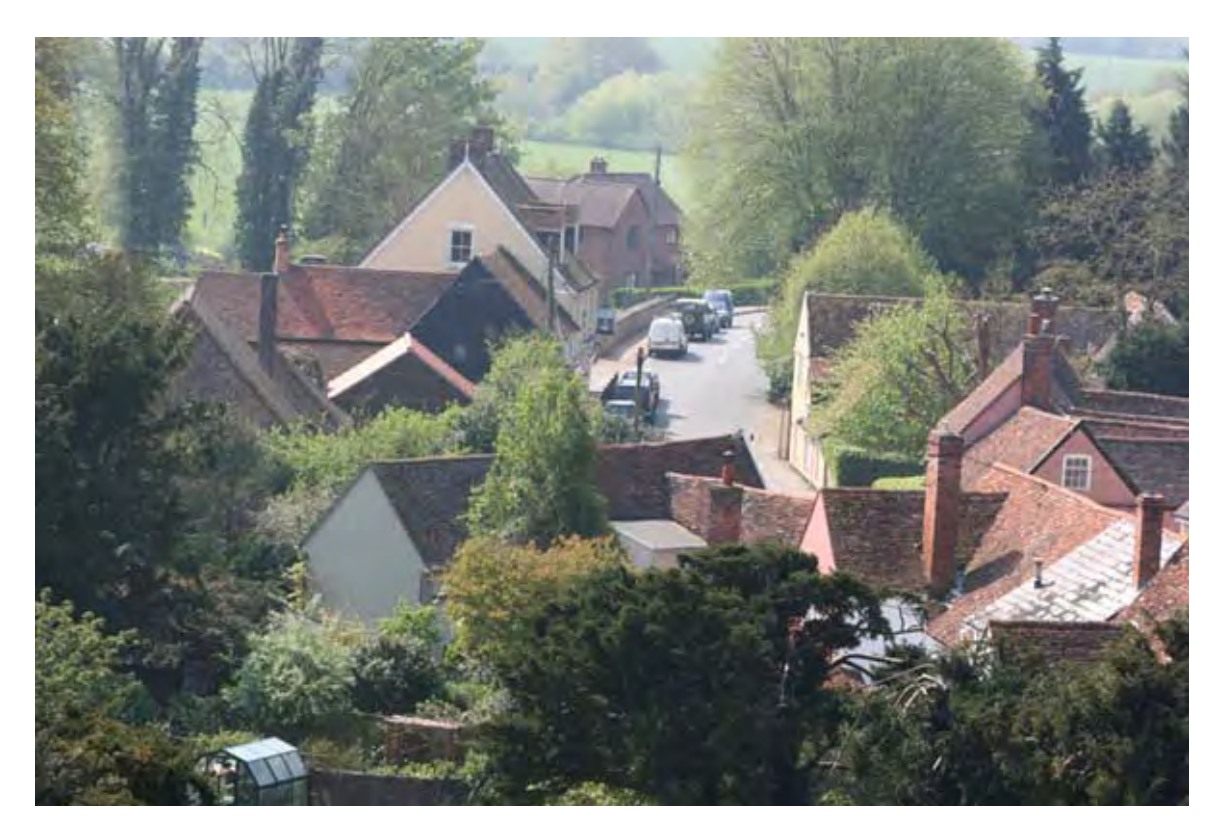
Trevor Smy: View of Anchor Bridge from St James' church tower