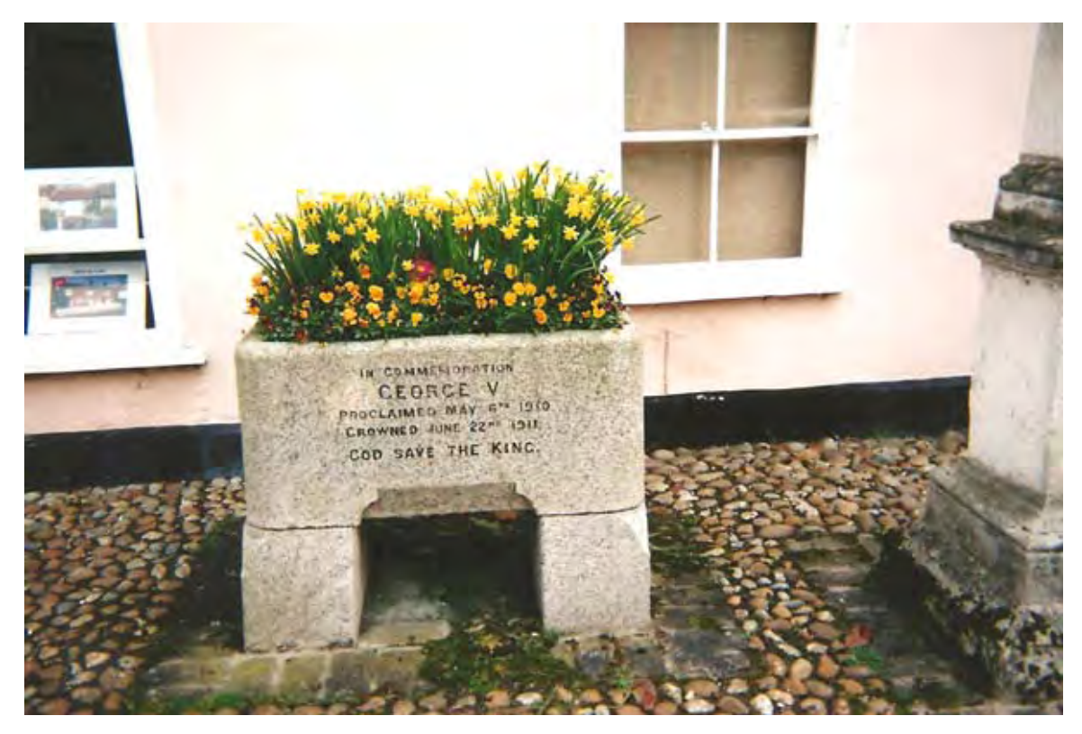
Colin Ramsell: Trough in High Street