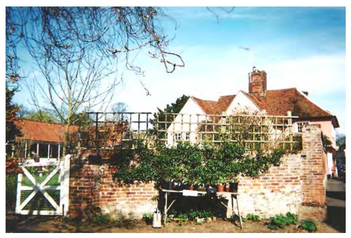
Colin Ramsell: Plant Stall at Parkers, Bear Street