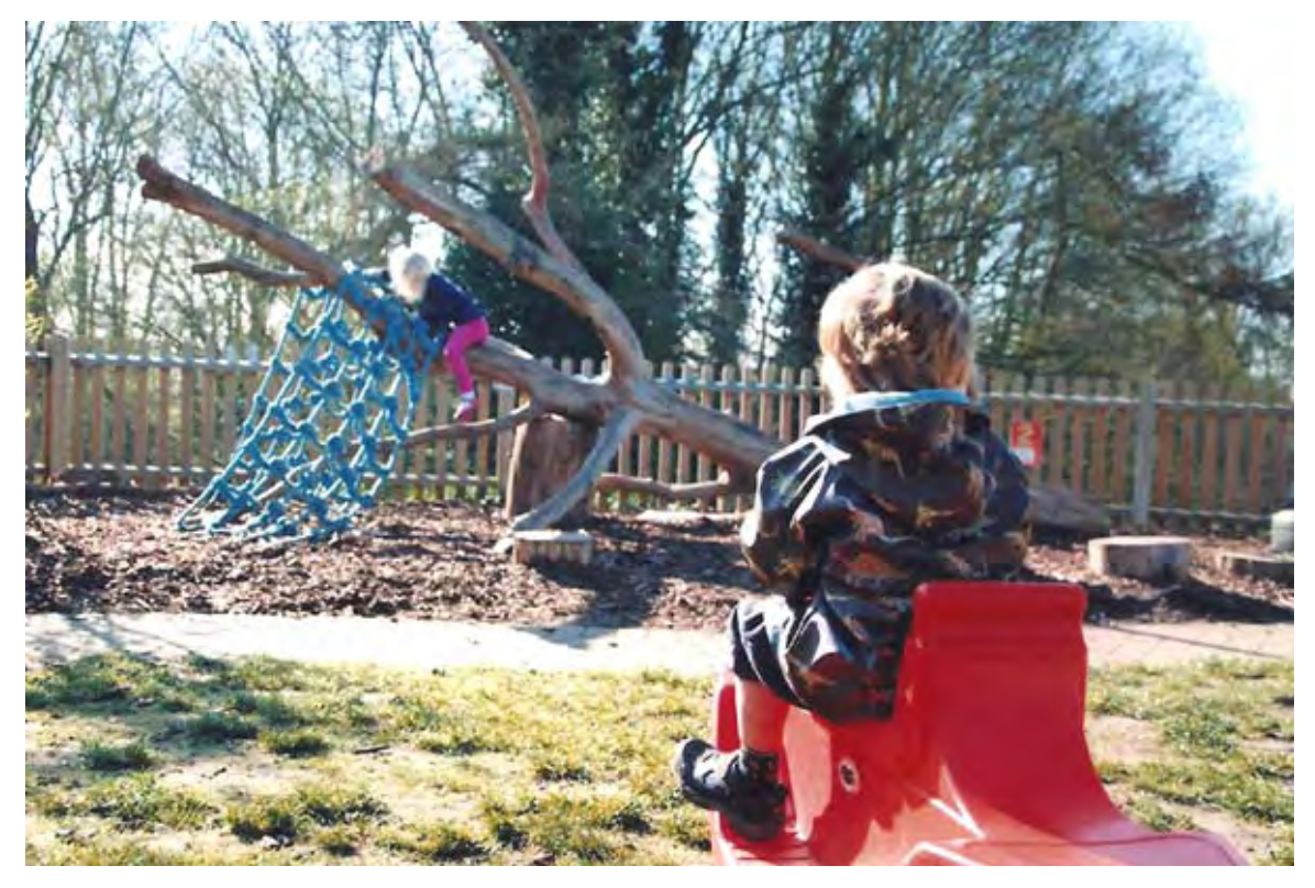
Juliet Wormington: Children playing at Woodland Corner