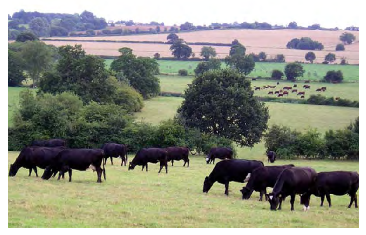
Lorraine Brooks: Rushbanks Cattle in the Valley