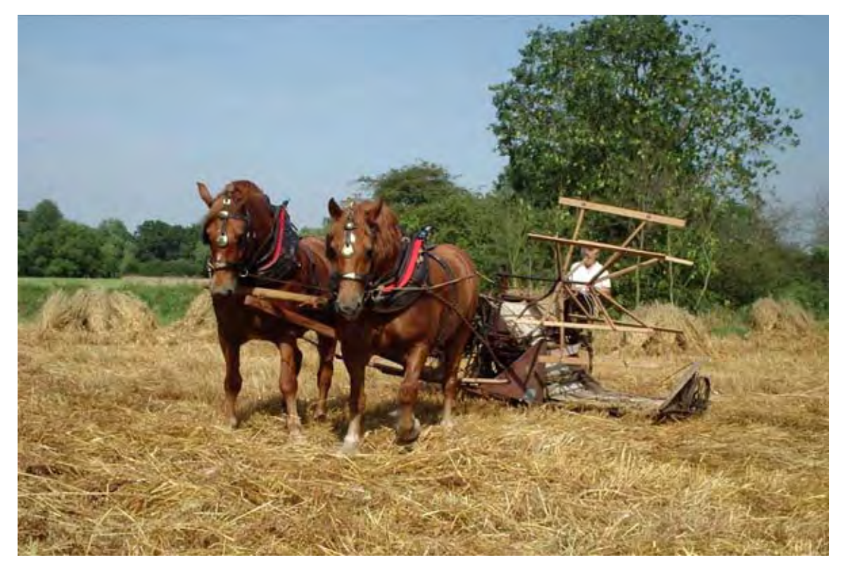
Pat Bray: Suffolk Punches working