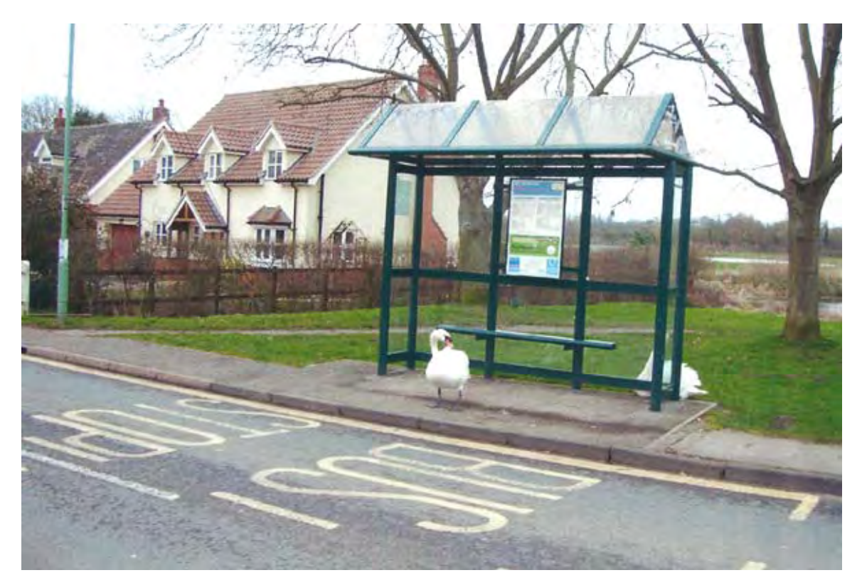
David Jackson: Swans at the bus stop