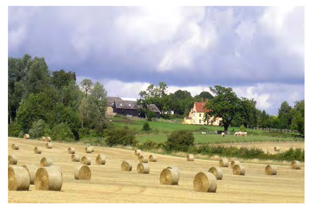
Antony Day: Harvest time in Wiston