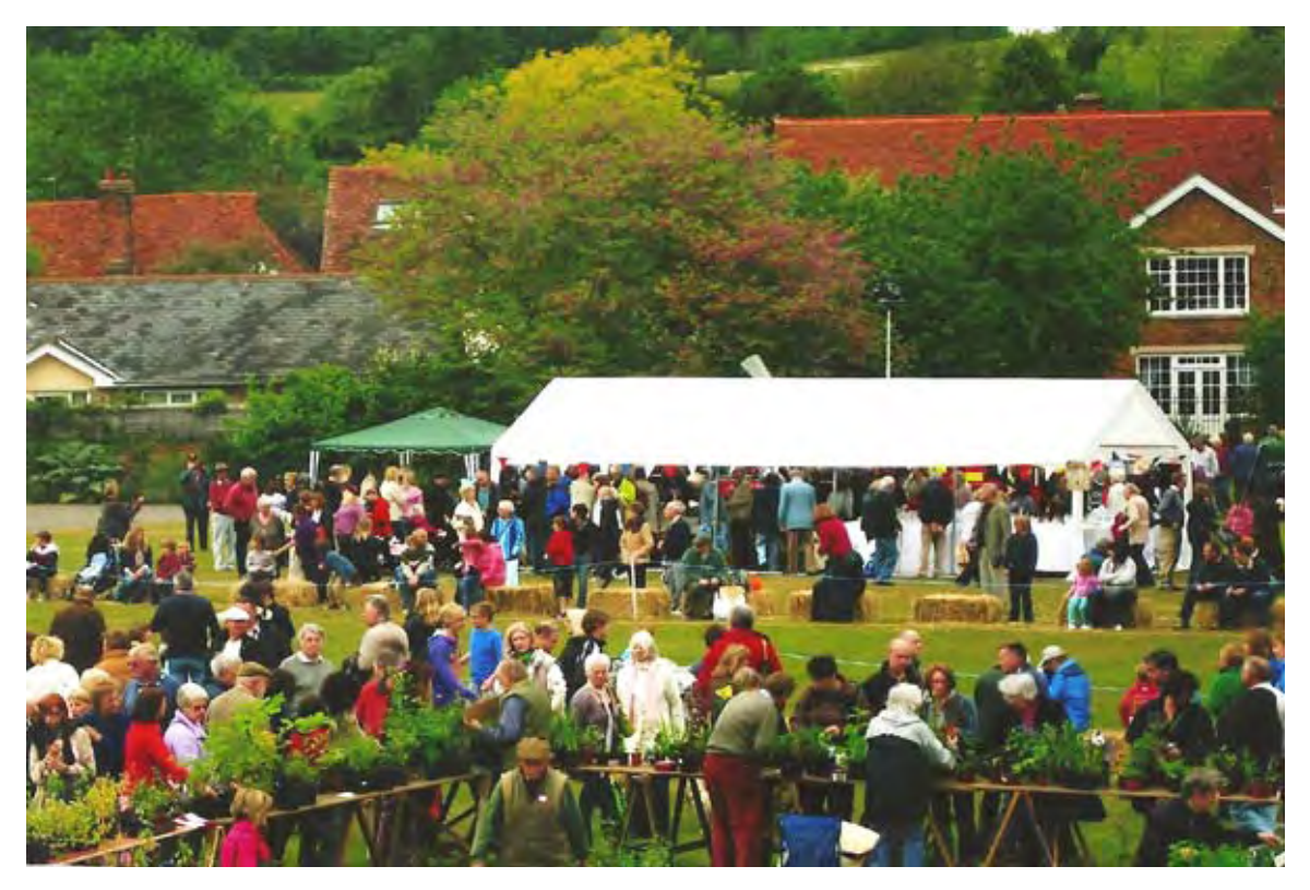
Mike Hunter: View of the Church Fete