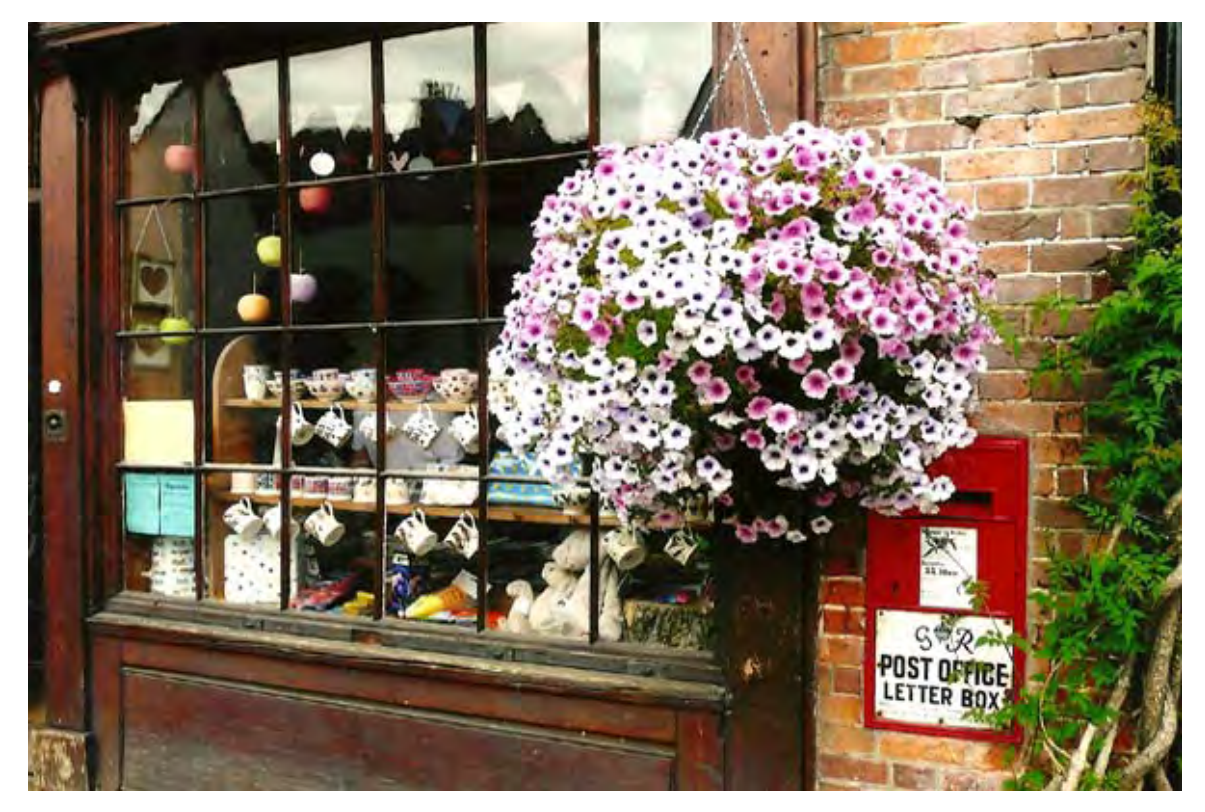
Kathy Hunt: Floral display at the Post Office