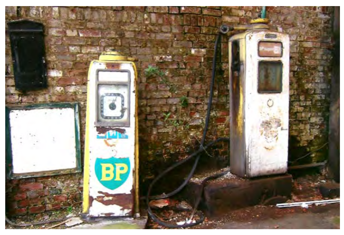
Hazel Gardiner: Petol Pumps in Mill Street