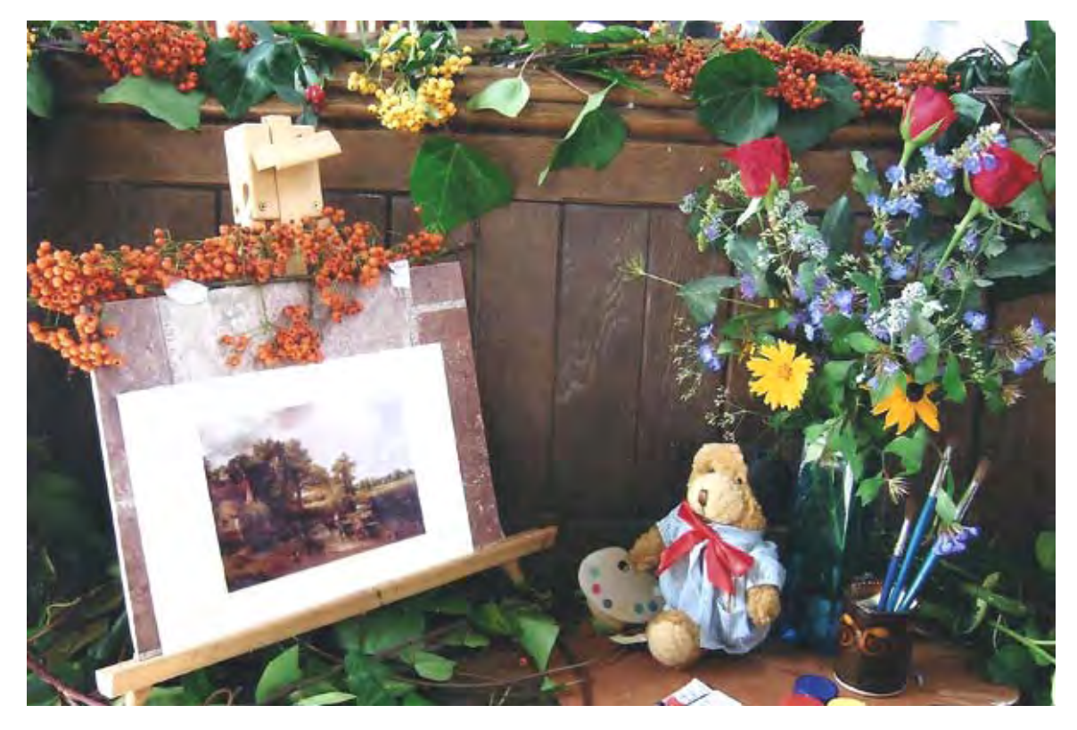
Hazel Gardiner: Art Group's display at the Flower Festival