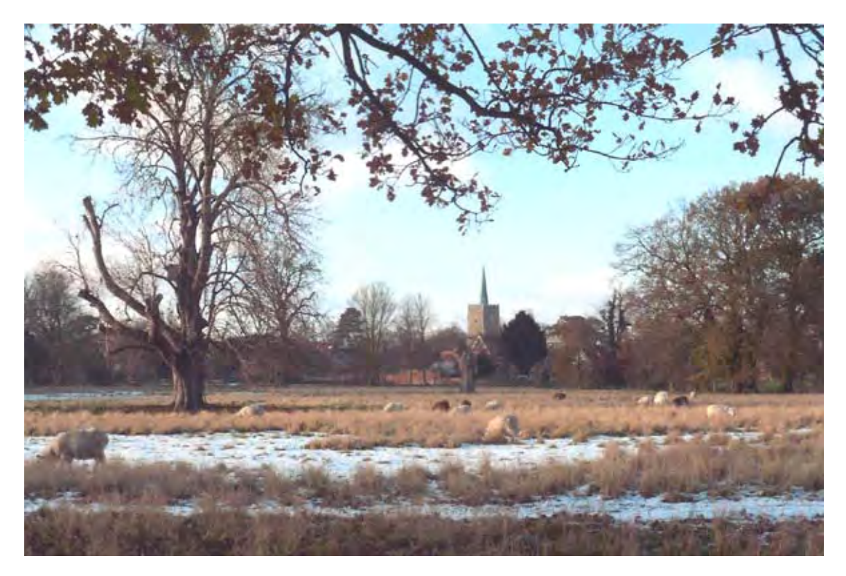
Winter view of Alston Court field and St James