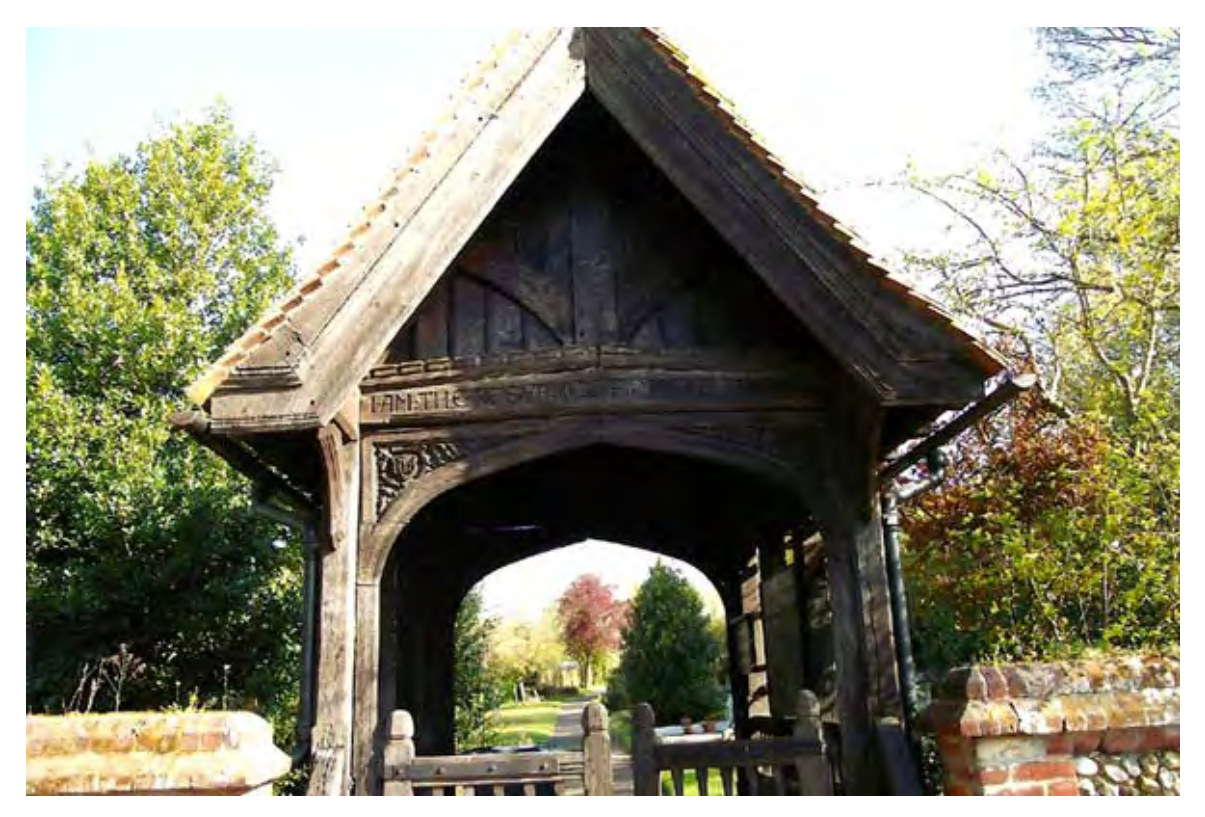
Wendy Sparrow: Lychgate at Nayland Burial Ground