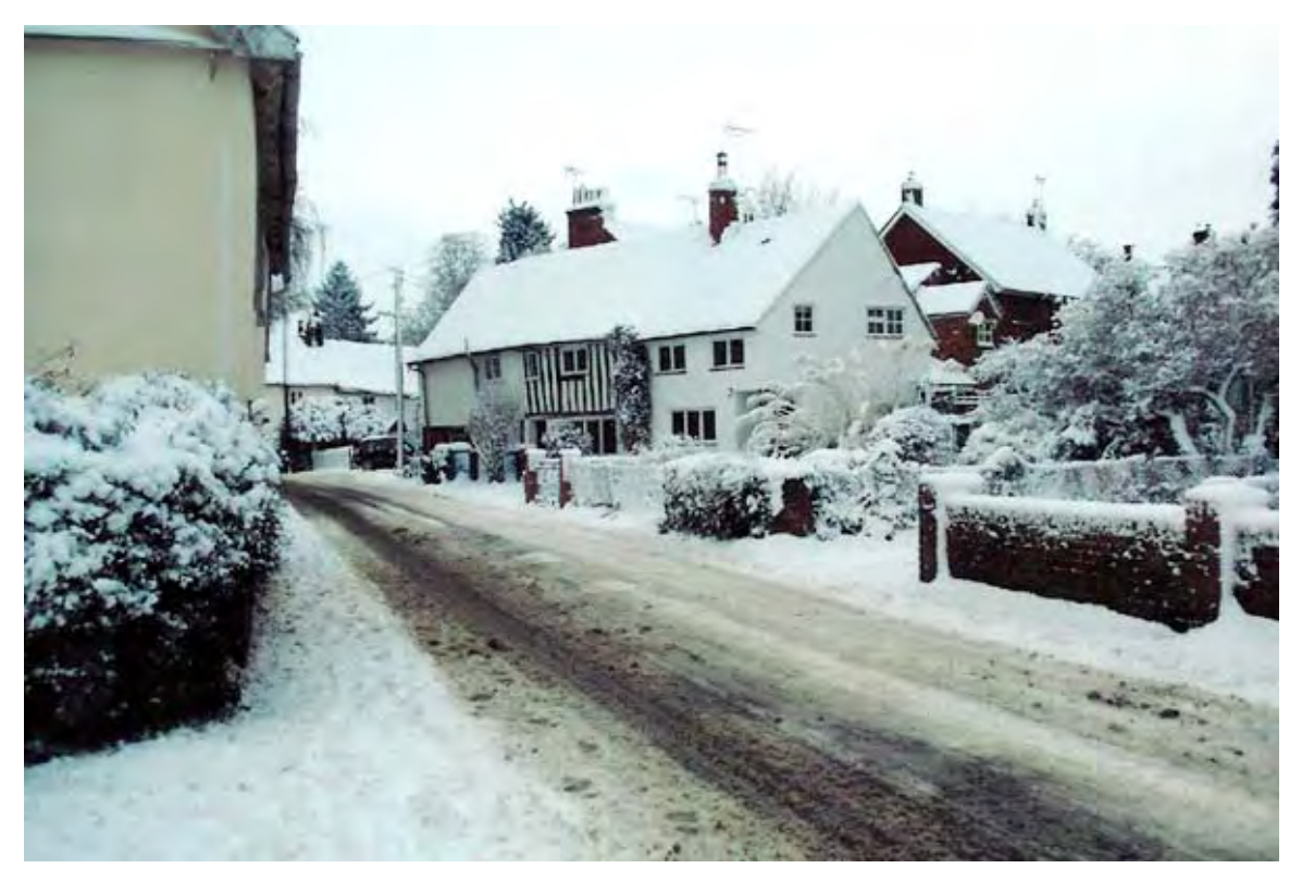
Shirley Scarlett: Snow in Stoke Road