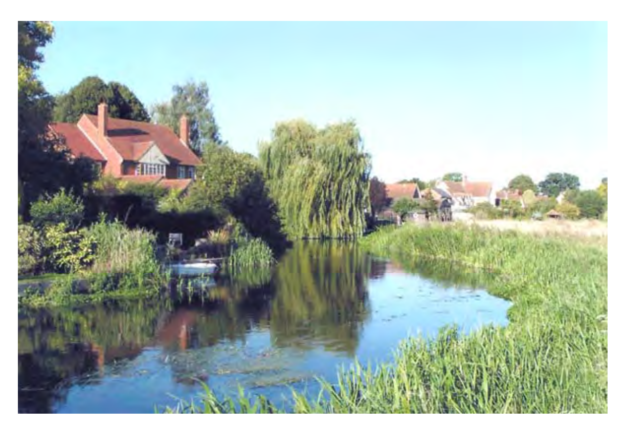
Graham Wiles: The Stour behind Bear Street