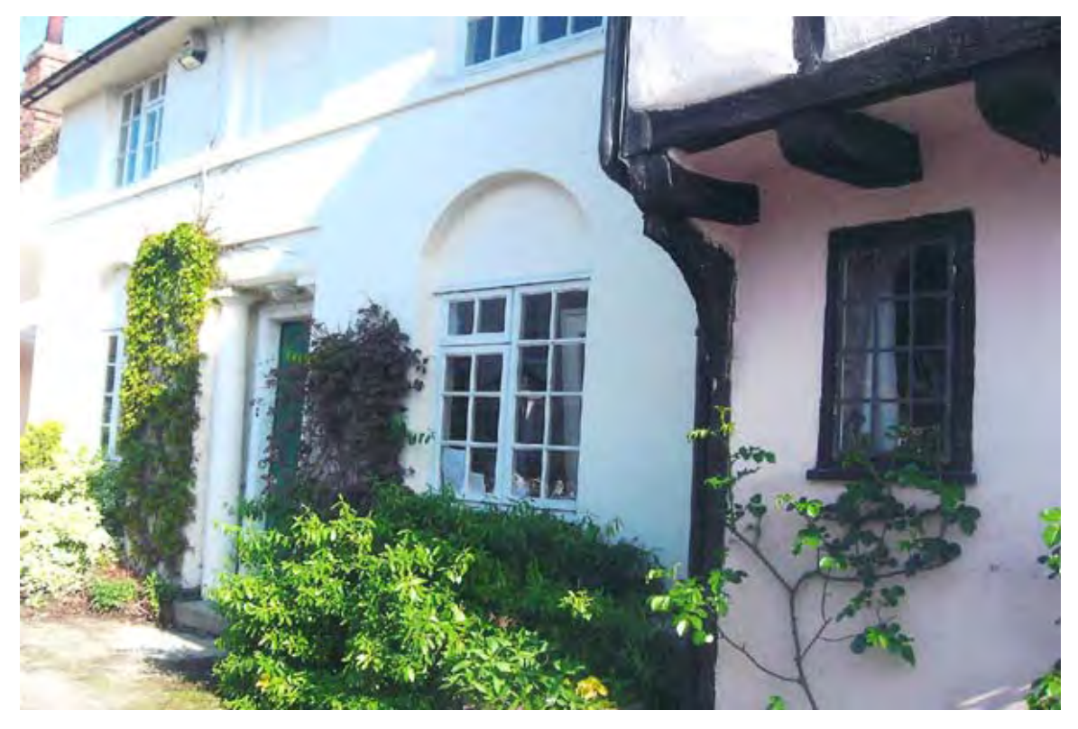
Mary Knapp: Cottage in Fen Street