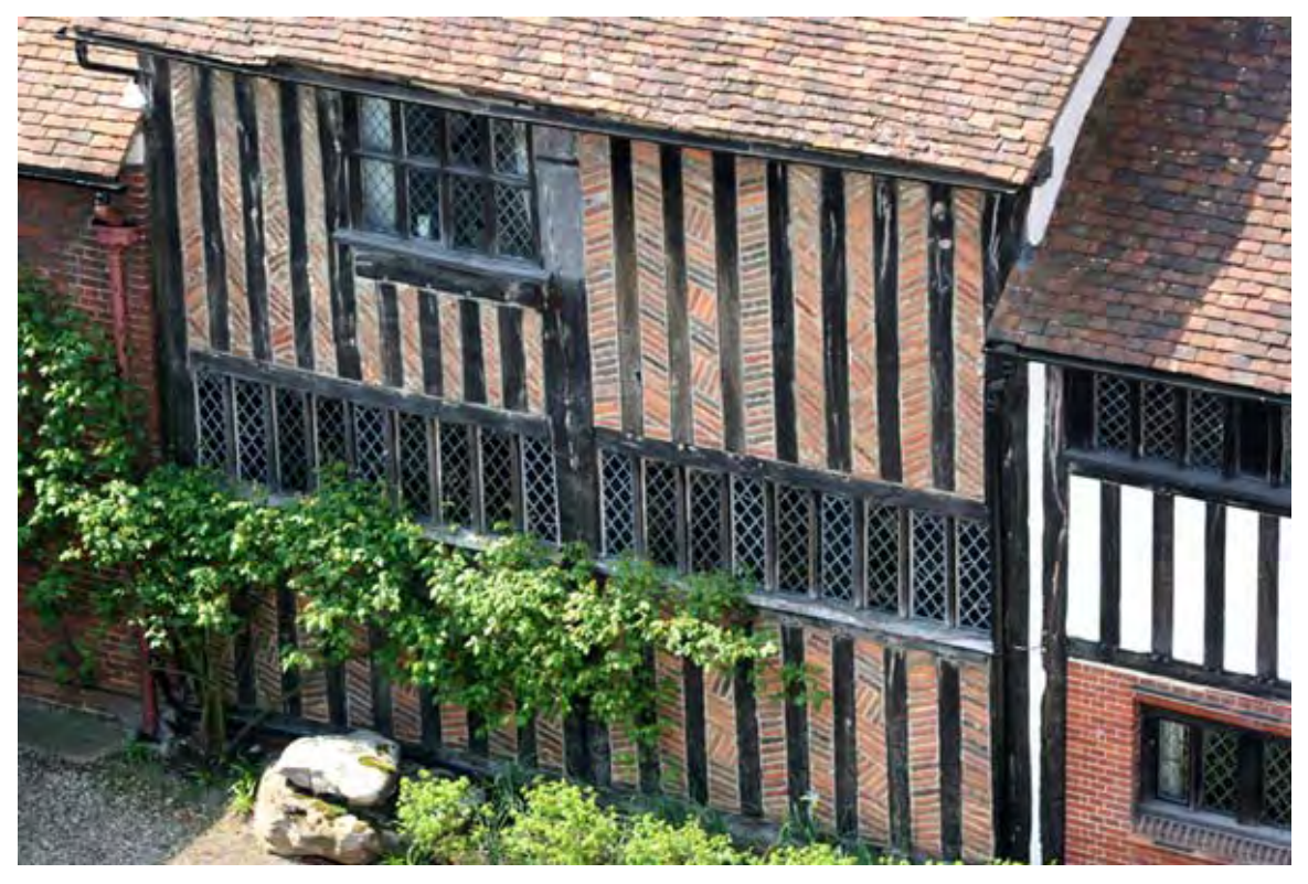
Trevor Smy: Wall of Alston Court from the Church tower