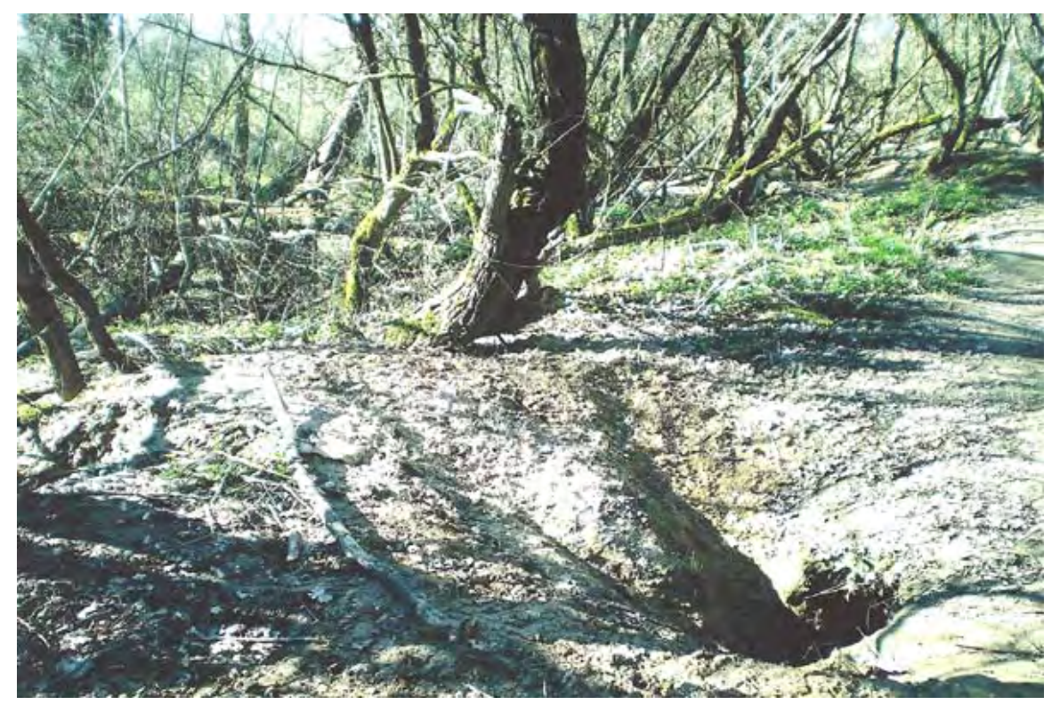
Sandra Gibbons: Badger Set in Wiston woodland