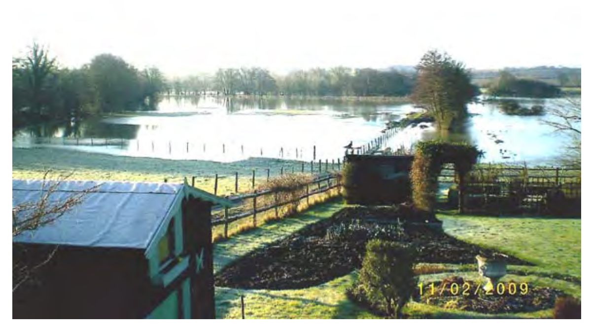
Sandra Gibbons: River Stour in flood at Rushbanks Farm