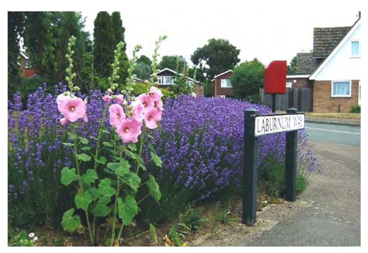
Hazel Gardiner: Lavender at Laburnum Way