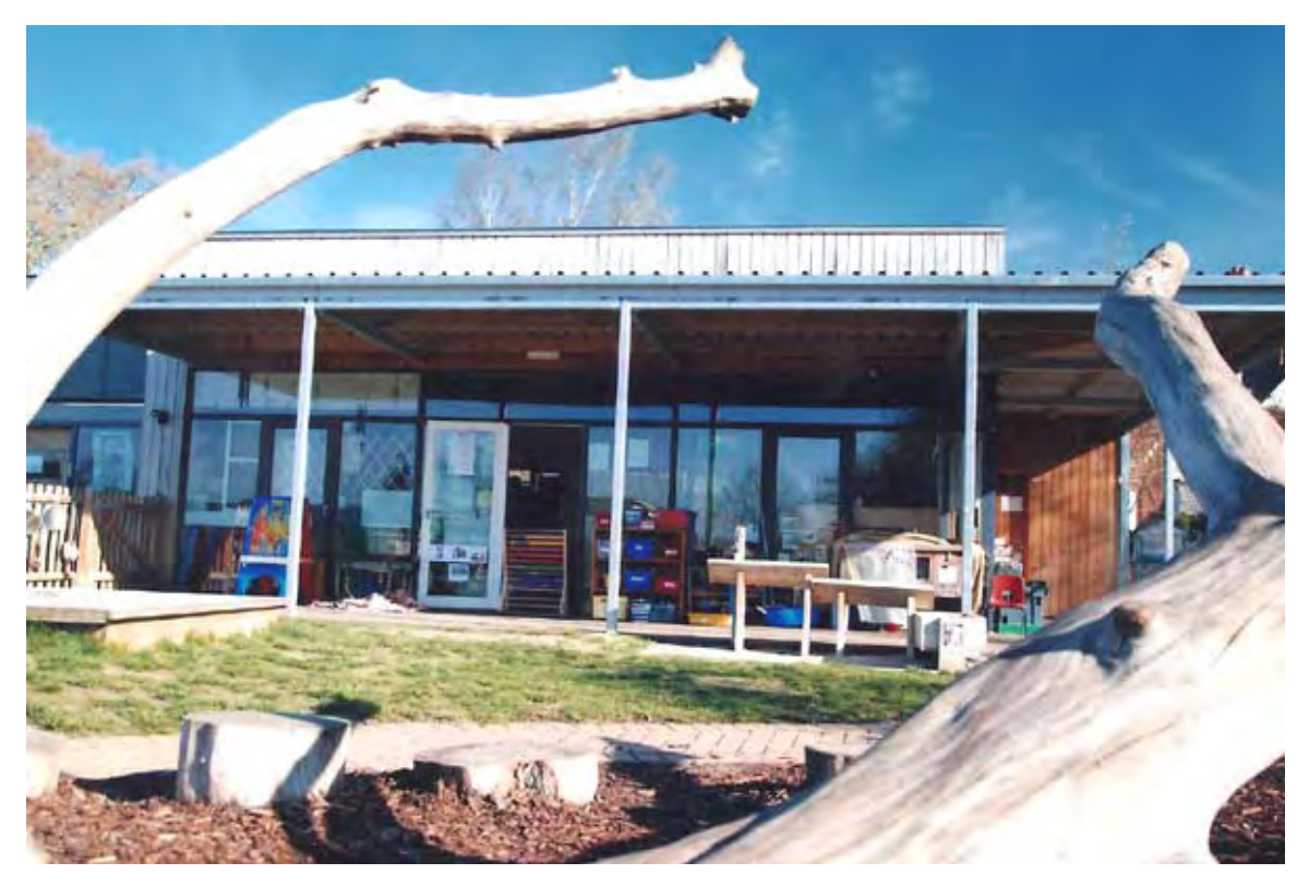
Juliet Wormington: The new Woodland Corner building