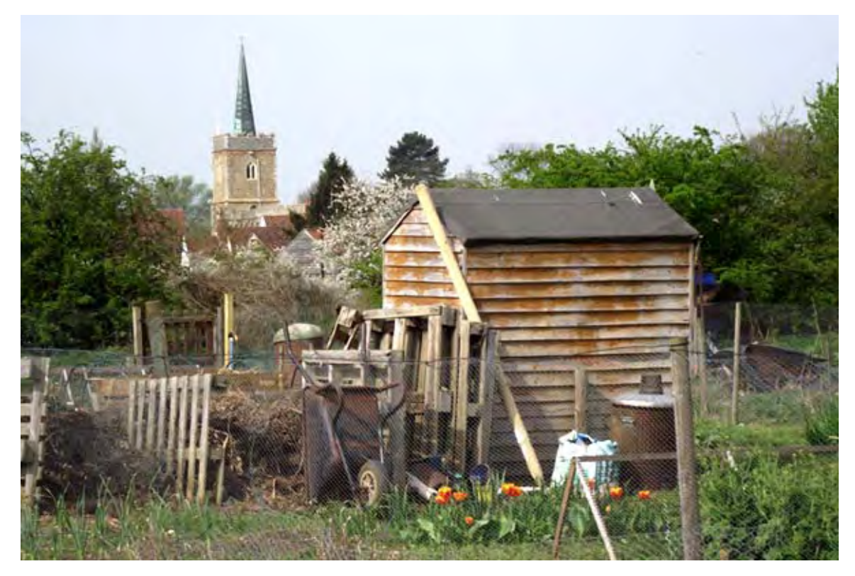
Wendy Sparrow: Nayland Allotments