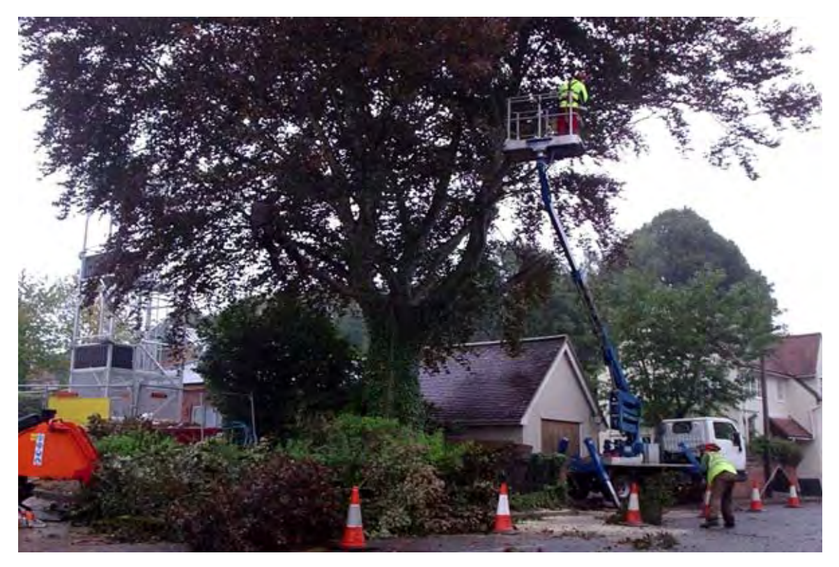
Pat Bray: Felling the Copper Beech Jubilee Tree in Bear Street