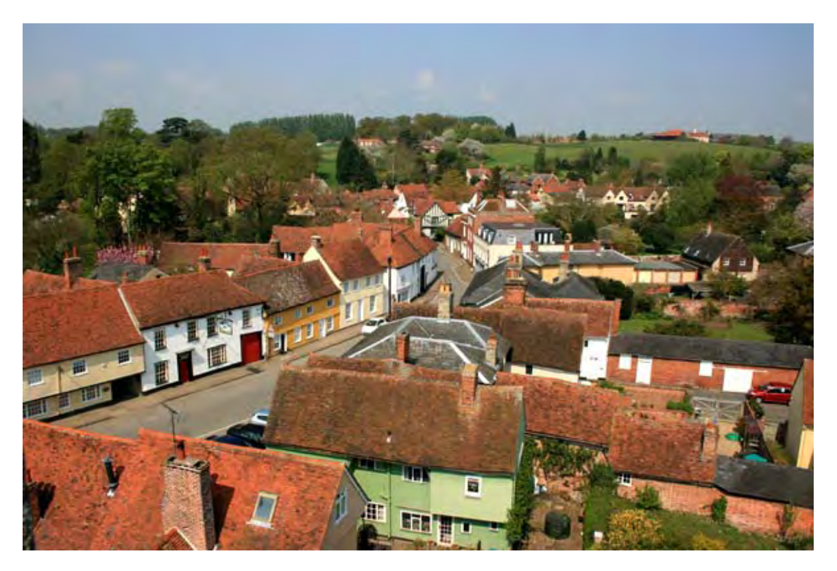
Trevor Smy: View of High Street from St James' church tower