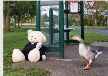
Sponsor: NAVLANDS Our old friend Bear who has entertained the village with his many antics and activities over the past few years, especially during the pandemic and at the end of the year, is to be replaced by a duck. We are looking for a duck to be the new Bear. The duck will be placed in the park and will be used to entertain the many people visiting the park. Since the old friend Bear has been much missed.