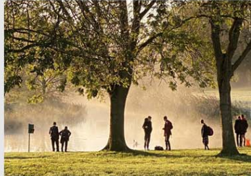
Sponsor: Oaklands Farm Ltd Early in the morning schoolchildren waiting for their bus to school have a lovely view of the meadows. However, since the bypass was built in the 1960s the area has been used for the disposal of refuse and other rubbish. Only a few children have seen the meadows from the bus but it would have been one of the most beautiful views in the village. Only a few children have seen the meadows from the bus but it would have been one of the most beautiful views in the village. Only a few children have seen the meadows from the bus but it would have been one of the most beautiful views in the village.