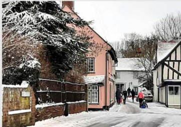
Sponsor: Nayland Primary School Mill Street in the more tranquil and peaceful but it has always been a busy street. Since the bypass was built in the 1960s it was part of the road to Safford. Today it is used with regular traffic but in the 17th century it would have been a busy thoroughfare. As well as local businesses, horse boxes were based on the street and at three corners of farm wagons would be used to drive the oxen of the mill.