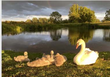
Sponsor: The Ark Farm The number of swans and their cygnets on the river vary every year. It is interesting to watch them building nests in the reeds or on the pond on the Nayland Meadows, and then to see the cygnets hatch and waddle into the water with their parents. Their waddles look so funny every day. Amazingly cygnets to see how many survive until they are abandoned by their parents.