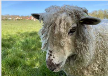
Sponsor: Oaklands Farm Sheep and their lambs are put out to graze on the Nayland Meadows every year and seem to enjoy their temporary home. Recently there has been a lot of activity on the meadows following the opening of the new game reserve with many trees being planted and an enormous amount of work has been undertaken with new fencing and hedging. The new year provides an opportunity to visit and enjoy the view.