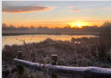
Sponsor: Nayland Dental & Cosmetic Clinic Nayland Meadows, owned by the village, is an attractive place in all seasons of the year. Formerly known as the field was purchased with residents' donations in 2004 and is now managed by the Nayland and Wissington Land Company Ltd. As the years go by it is becoming a valuable habitat for wildlife and will be maintained in perpetuity for the residents of Nayland and Wiston.