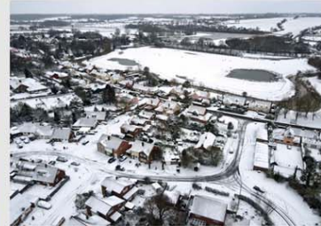
Sponsor: Luke Spaven Ltd This interesting aerial view shows the extent of the houses on the Nayland Heights which were built during the 1960s. The river and adjacent Nayland Meadows were the ground for many years. It is all now the wonderful view of Nayland Park in the village when approaching from Haverhill Hill but being from the north of the village in a different perspective highlights the changes in more recent years.