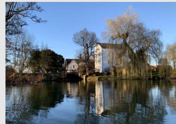
Sponsor: Friends Building Co Ltd This lovely view of the south side of the mill at Wissington can be seen from the Essex bank of the river. The mill was one of the largest in Suffolk and served as a working mill in the 1920s. The building has been much altered over the years and in the 1920s the main part of the mill was converted to a residence. The mill tower had previously lived in the house along the line leading to the mill.