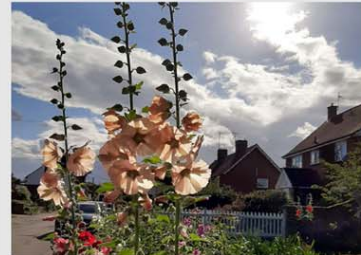
Sponsor: Nayland Churches Fen Street must be the prettiest street in Nayland especially during the spring and summer months. It was once a busy part of the village with many houses and cottages and was covered over by the river in the 1920s. The street was one of the most beautiful in the village. It has been very busy and probably still is in the future and will be a beautiful and well kept area, each house and cottage unique in its own way.